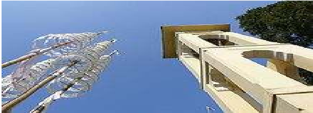
Shree Shree Govindajee Temple

This temple in Manipur diplomatically adjoins the palaces of the former rulers of the then kingdom, dull in design with gold domes, a paved court and a large, raised congregation hall. The deity in the center has other idols of Radha Govinda, Balaram and Krishna and Jagannath, Balabhadra and Subhadra on either side of it.