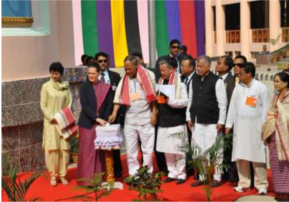
Honourable Smt. Sonia Gandhi, Chairperson of UPA in the presence of Honourable Shri. Okram Ibobi Singh, Chief Minister, Manipur, and Kumari Selja, Honourable Union Minister (Housing & Urban Poverty Alleviation & Tourism, GOI) inaugurating Ima Market, on 12 th of November 2010

Whatever the controversies, the market will remain a unique historic symbol of women empowerment and women's leadership in economic development. This is something the policy makers of any country, regions can think of as a model for women empowerment and gender justice in the society.