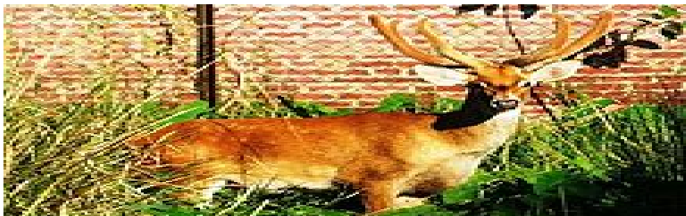
Sangai at Keibul Lamjao National Park