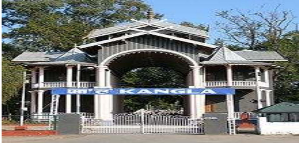
The Kangla Gate (west entrance to the Kangla Fort)

Manipur came under British rule as a princely state (kangleipak) in 1891 and existed until 1947, when it acceded to the newly independent Union of India. During the World War II, Manipur was the scene of many fierce battles between the Japanese and the Allied forces. The Japanese were beaten back before they could enter Imphal, and this proved to be one of the turning points of the war. After the War, the Manipur Constitution Act of 1947 established a democratic form of government with the Maharaja as the Executive Head and an elected legislature. In 1949, Maharaja Budhachandra was summoned to Shillong, capital of the then Indian province of Assam. The legislative assembly was dissolved on the controversial annexation of the state with the republic of India in October 1949. Manipur was a union territory from 1956 and later became a full-fledged state in 1972.