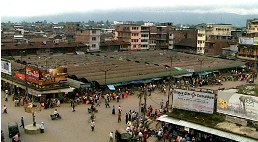
The aerial view (from flyover) of the Ima Market before the demolition for constructing of the new market