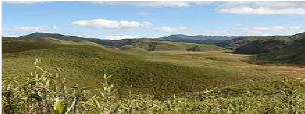
The Dzuko Valley lying on the border of Manipur and Nagaland

The climate of Manipur is largely influenced by the topography of this hilly region which defines the geography of Manipur. Lying 790 meters above sea level, Manipur is wedged between hills on all sides. This northeastern corner of India enjoys a generally amiable climate, though the winters can be a little chilly. The maximum temperature in the summer months is 32 degree C. In winter the temperature often falls below zero, bringing frost. Snow sometimes falls in some hilly regions due to the Western Disturbance. The coldest month is January, and the warmest July. The ideal time for tourism in the state, in terms of climate, is from October to February, when the weather remains bright and sunny without the sun being too hot.