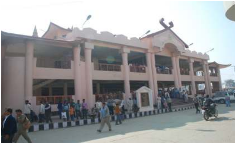
The New Ima Market: View no. 2