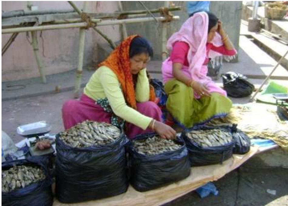
Women vendors selling dry fish, a popular food in north east India

local herbs to clothes and woollens, and traditional costumes. Metal and bamboo items are also found in the shops. The market consists of two main sections -one where the vegetables, fruits and necessary items are sold and the other where the handloom product of the state is sold. Ima market displays local culture, tradition and biodiversity. Products sold here are mostly local products.