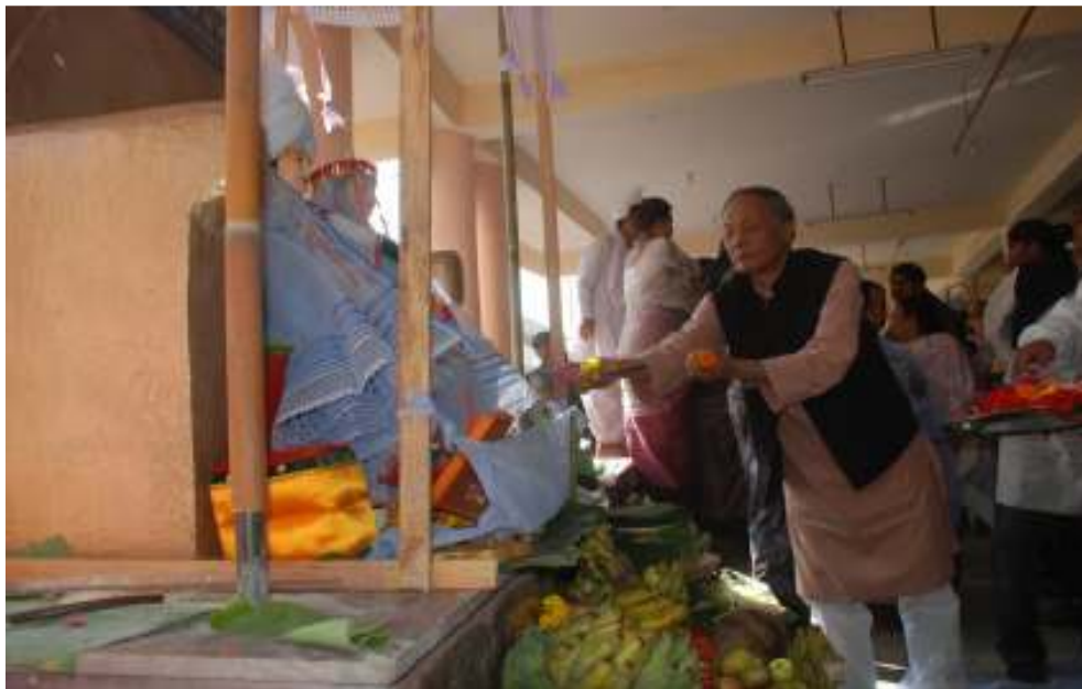
Honourable Chief Minister, Shri. Okram Ibobi. Singh, offering flowers to the Deity on the Inauguration of the market

The 3 (three) Markets in Khwairamband Bazar, namely Ima Market, Laxmi Bazar and Linthoinganbi Bazar constructed by the Imphal Municipal Council has replace the traditional sheds of the Ima market. This development is not beyond controversy. Starting from nomenclature of the three complexes, allotment of shops, feeling of discrimination etc will haunt the celebration for many women. Several indigenous bodies have objected the nomenclature of the three complexes terming it non representative of the culture and history of the land. Shops are allotted to ‘licensed’ vendors while some women said that an average of 300 single women and widows, mostly the widows whose husbands are killed in fake encounters join the market to earn their livelihood. Most of these women have no license. In such a situation there is risk that these women will lose their livelihood. Several bodies have demanded special allotment or reservation for their community women. Kabui community has demanded 200 shops while Muslim community has demanded 9% allotments in the new complexes.