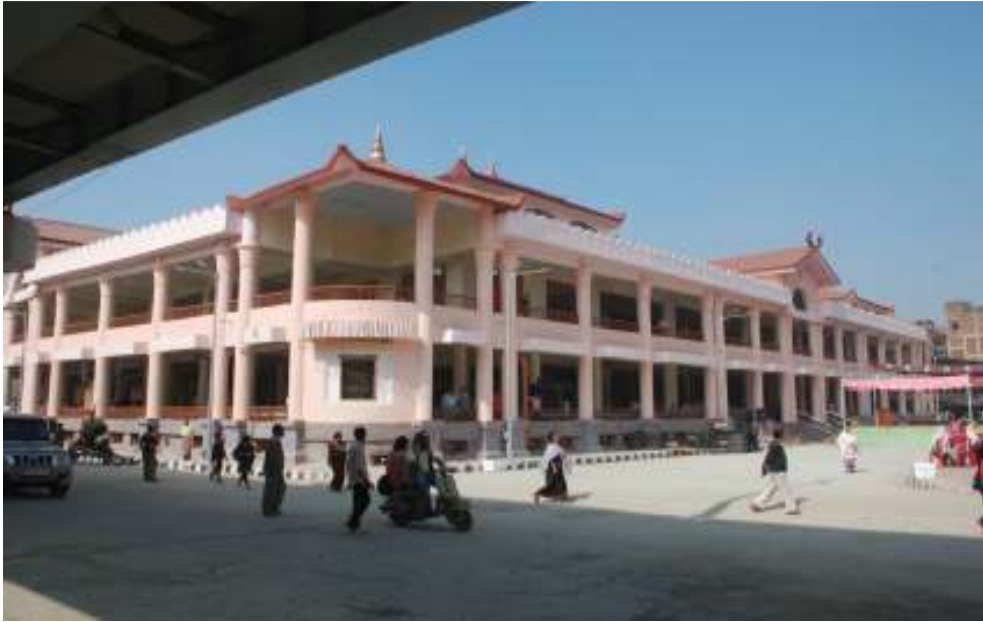
The New Ima Market: View no. 1