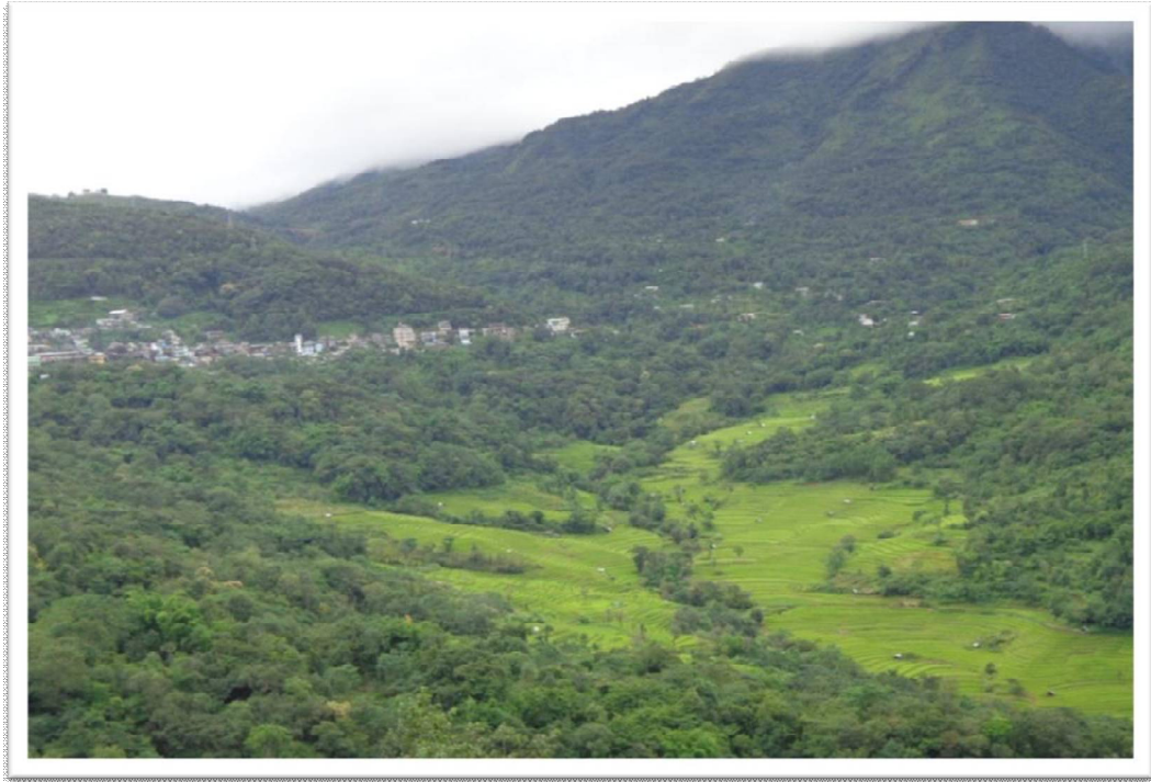
1. A view of a Mao village and paddy fields