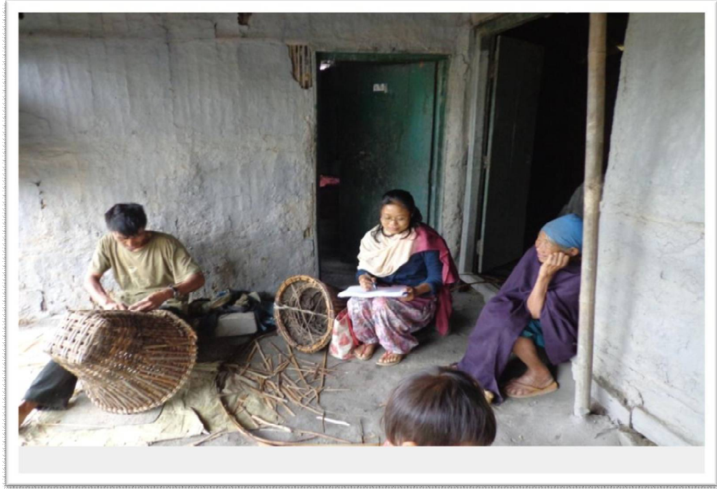
3. Researcher collecting information from a respondent