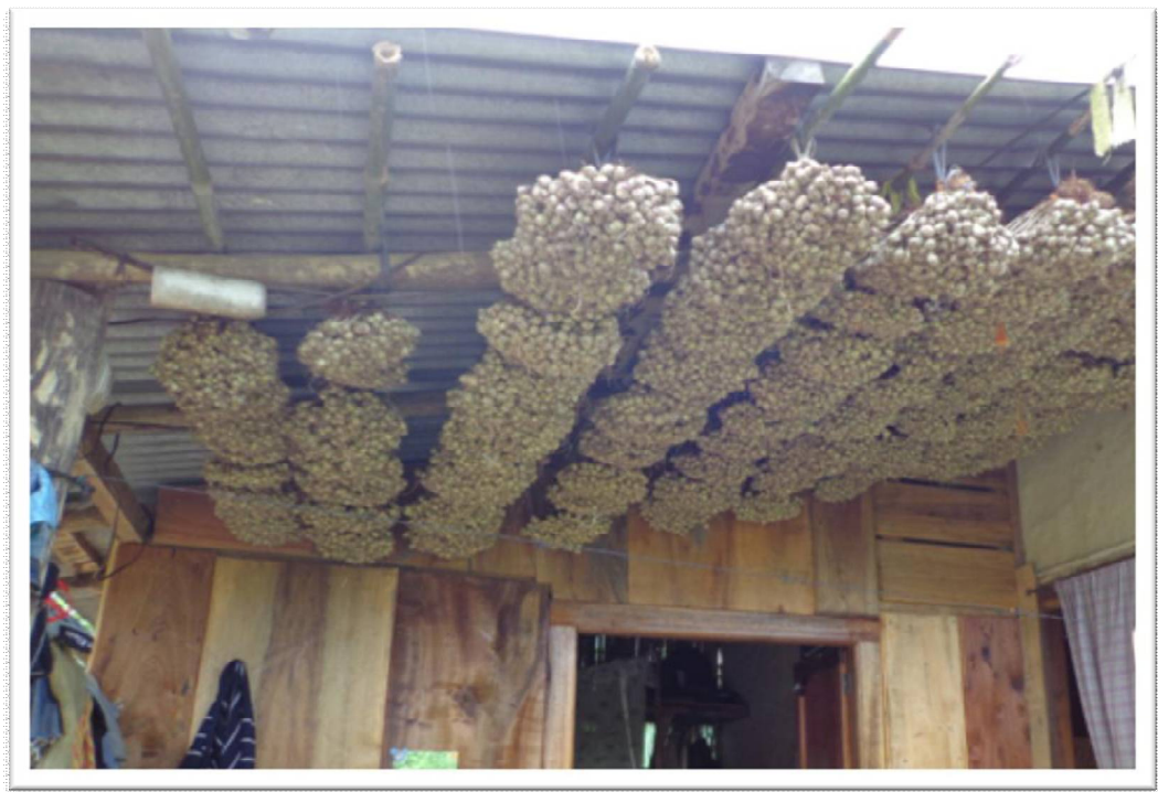
2. Traditional manner of storing vegetables by Mao farmers to use in off season