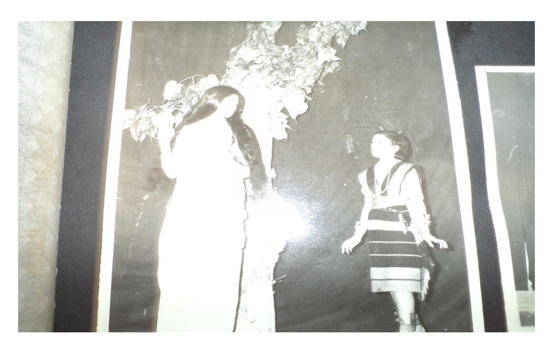
*A scene from Jaymati