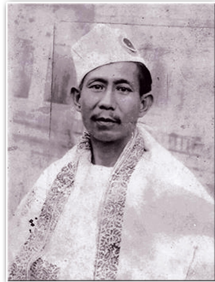
Hijam Irabat Singha (1896 – 1951)

Irabat Singha was a communist peasant leader and cultural activist who came to Cachar in March 1943 after his release from the Sylhet jail. He was imprisoned by the Manipur Government when he organised a peasant satyagraha in Manipur and sent to Sylhet jail on 15th August 1942. In Sylhet jail he endorsed his commitment to Marxism.