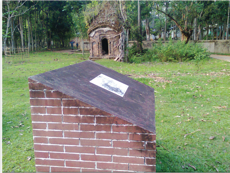
A view of Comrade Ajoy Bhattacharjee memorial pillar on the ruins of the residence of Ajoy Bhattacharjee at village Lauta under Beanibazar sub-division of Sylhet district, Bangladesh.