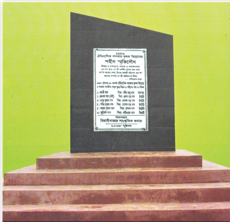
A view of martyrs' memorial of historic Nankar Rebellion of Sylhet district at Shaneshwar Bazar under Beanibazar sub-division of Sylhet district in Bangladesh.