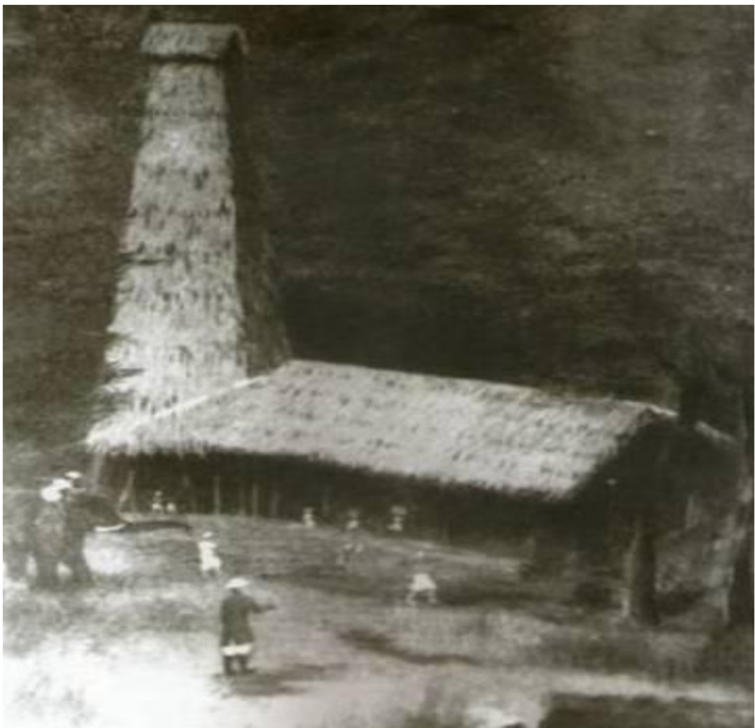
The Well of Goodenough, 1866