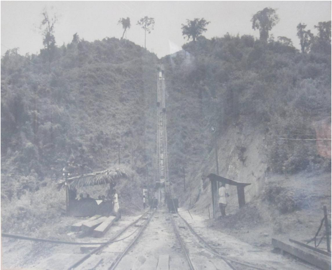
Namdang open cast Quarry, 1901.