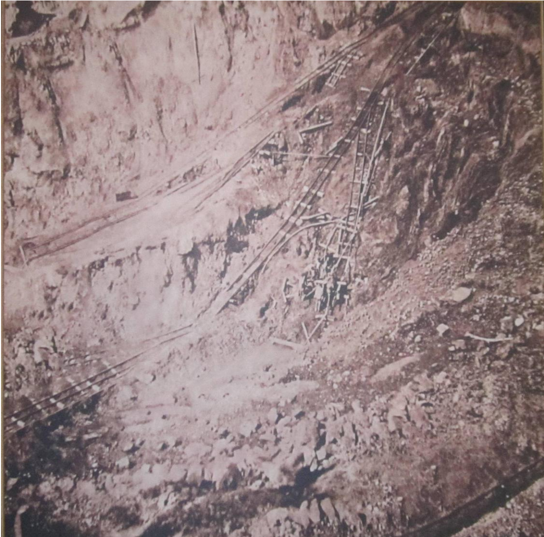
Namdang open cast Quarry, 1901.