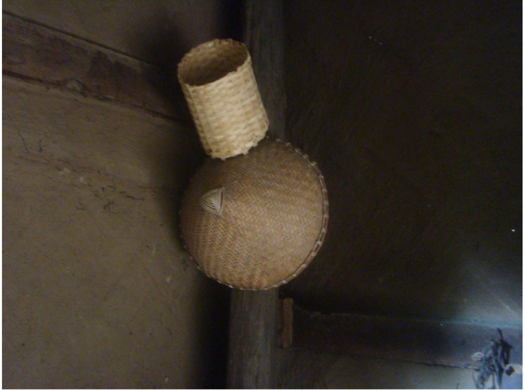
Fig. 07. Dimasa bamboo works, use for rice bear preparation, Yengthi and Chani.