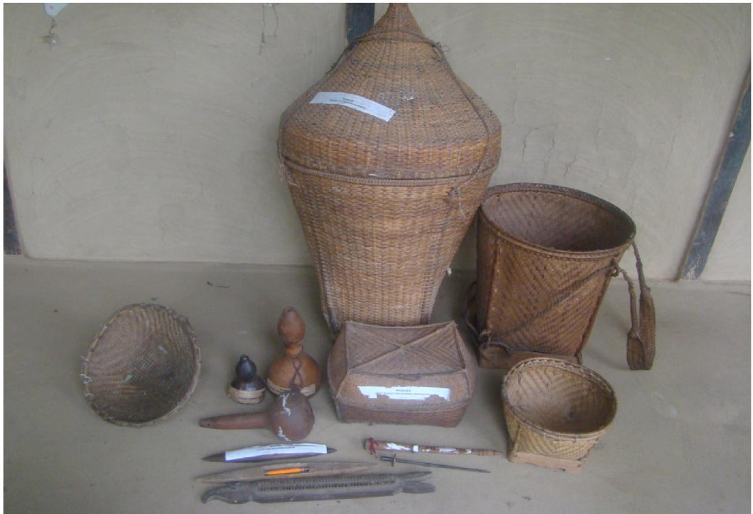
Fig. 08. Dimasa bamboo Works.