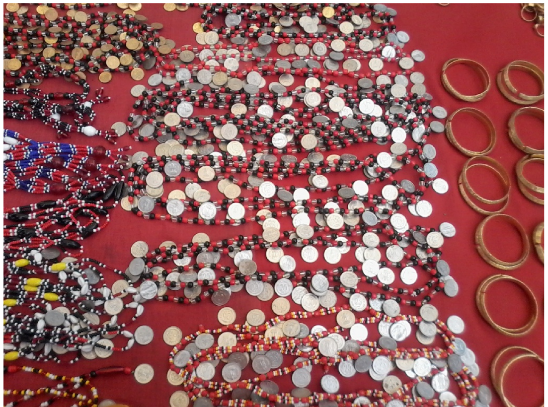
Fig. 20. Karbi traditional neckpiece of coins