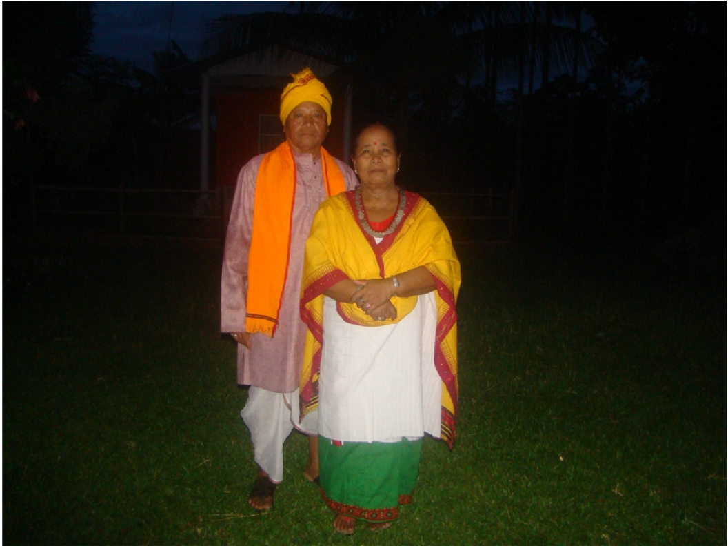
Fig. 05. Dimasa Couple with Traditional attire.