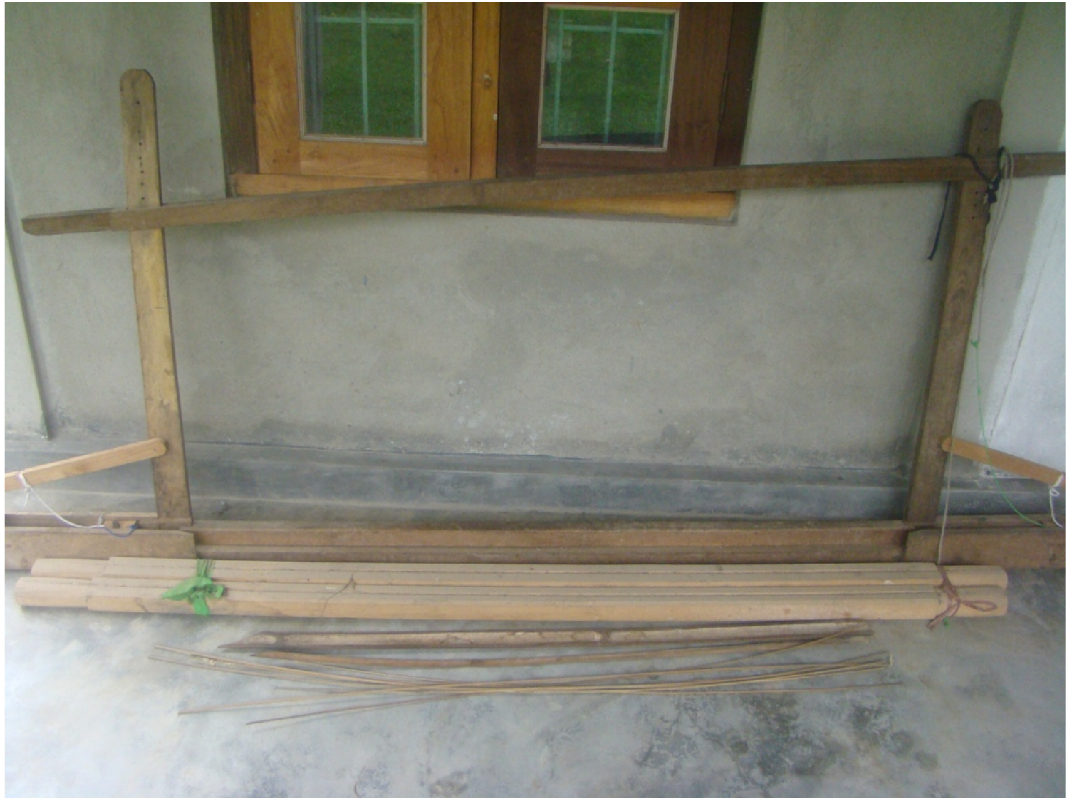
Fig. 01. Dimasa Traditional Loom, Dauphang