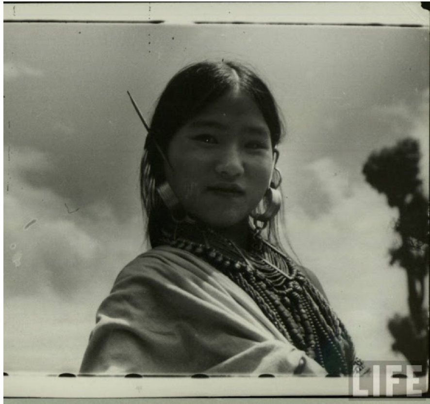
Fig. 11. Arunachali tribal women in traditional jewellery.