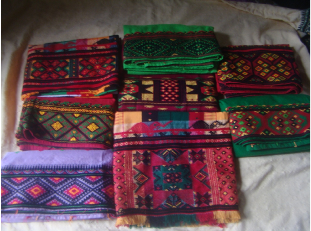
Fig. 15. Dimasa traditional attire with colourful motifs.