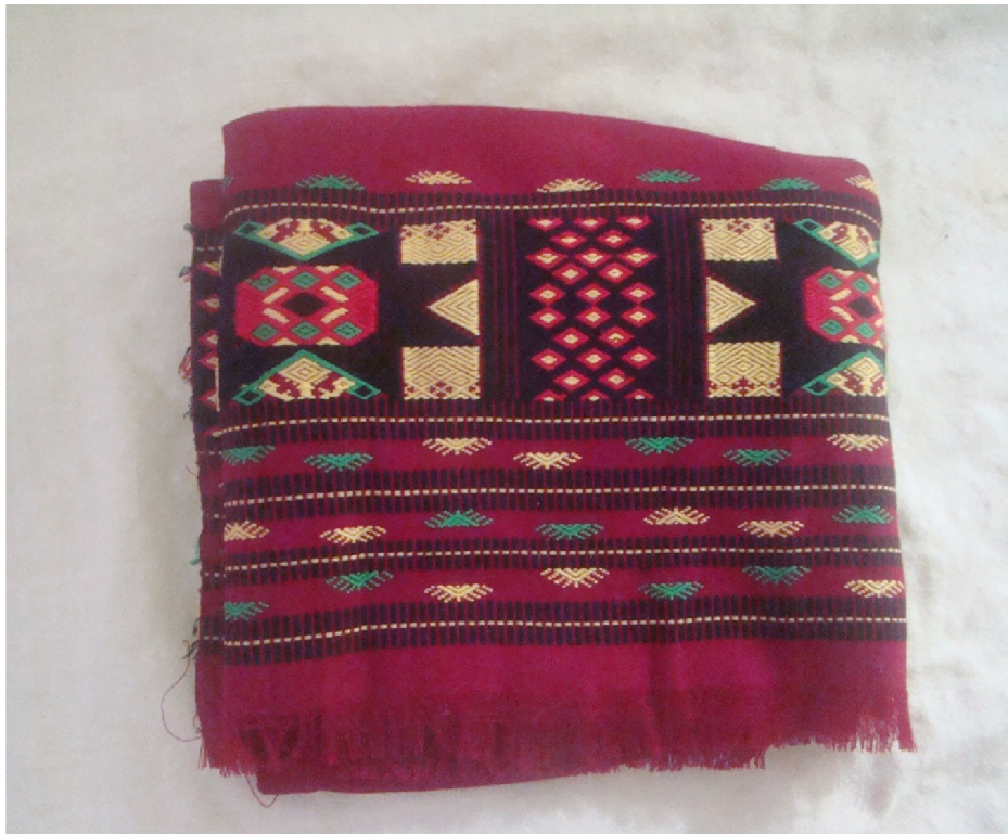
Fig. 18. Dimasa Chadar in Phanthaubar (Brigale flower) motifs.