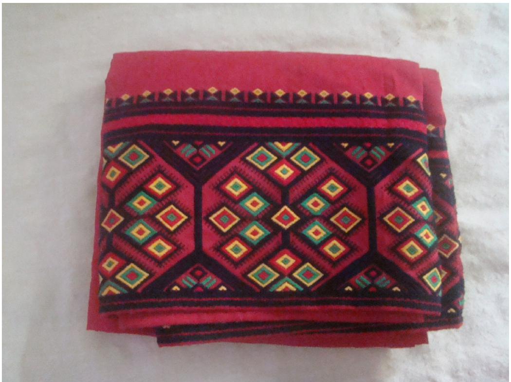
Fig. 16. Dimasa Rigue in wild flower motifs.