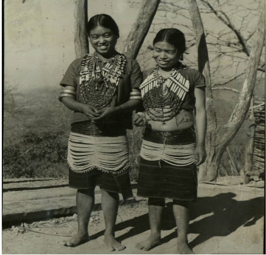
Fig. 09. Arunachali tribal women in traditional bead jewellery .