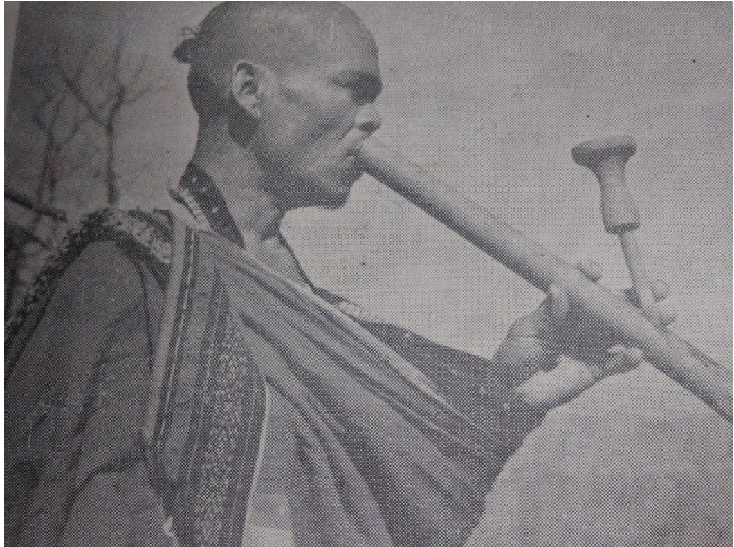
Fig. 13. Dimasa Man with smoking pipe ( Damkho )