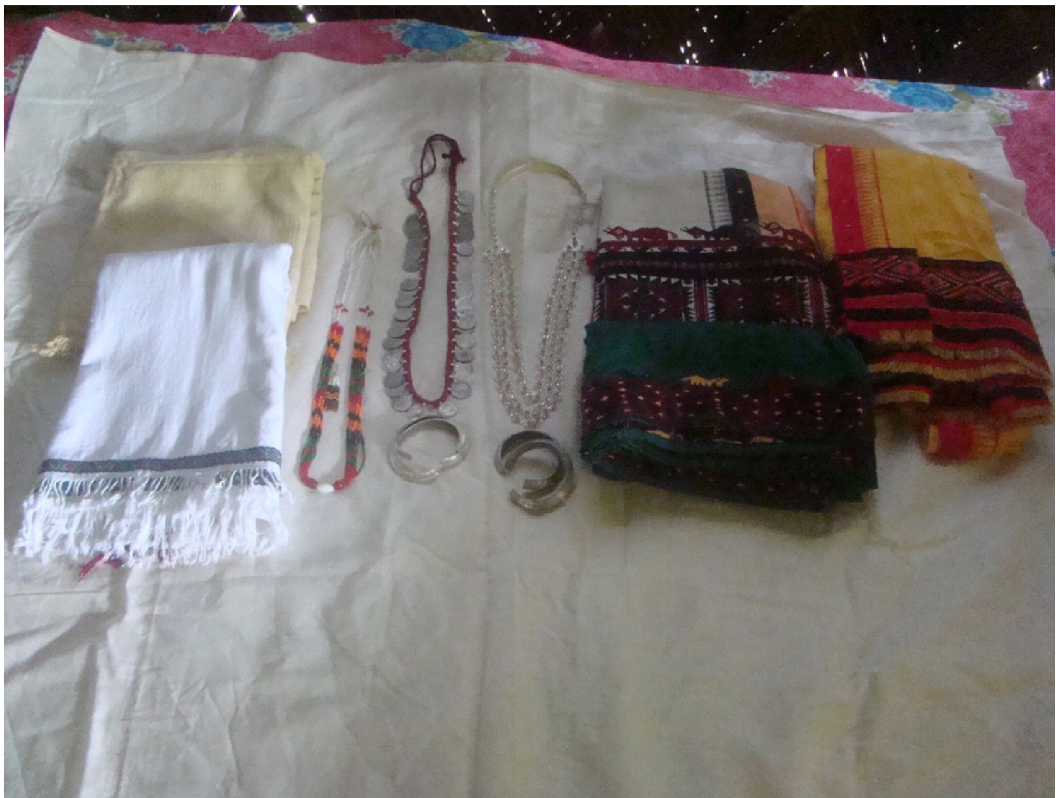
Fig. 06. Dimasa jewellery and hand woven cloths.