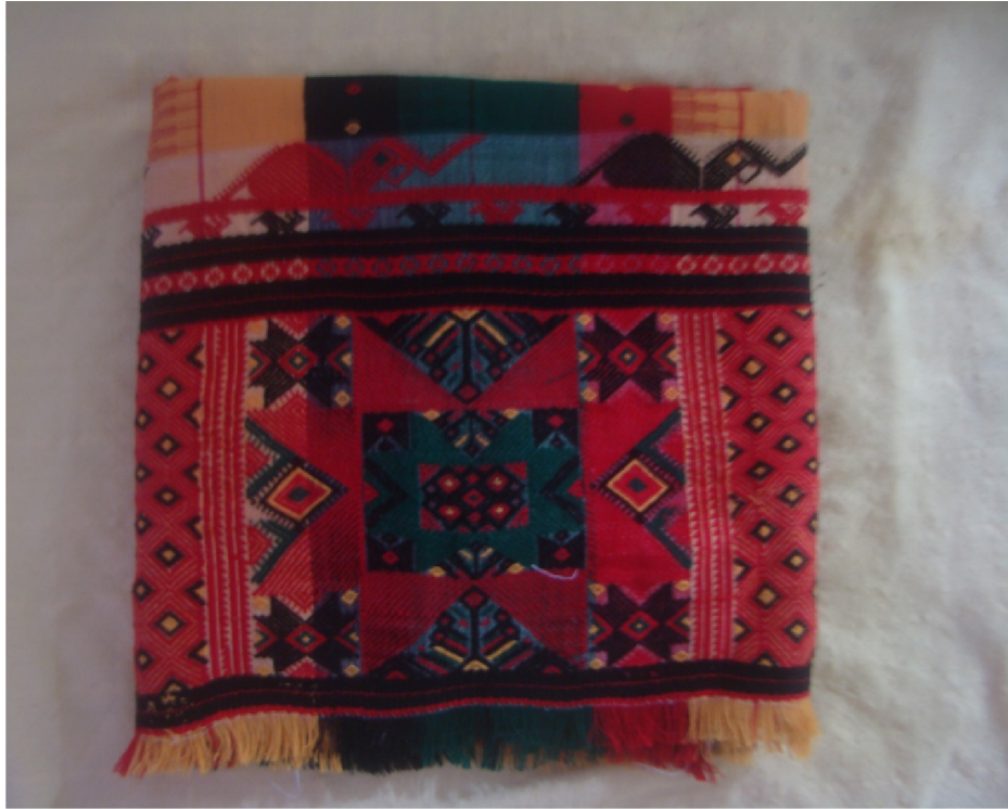
Fig. 17. Dimasa Rajamphain in Animal and flower motifs.