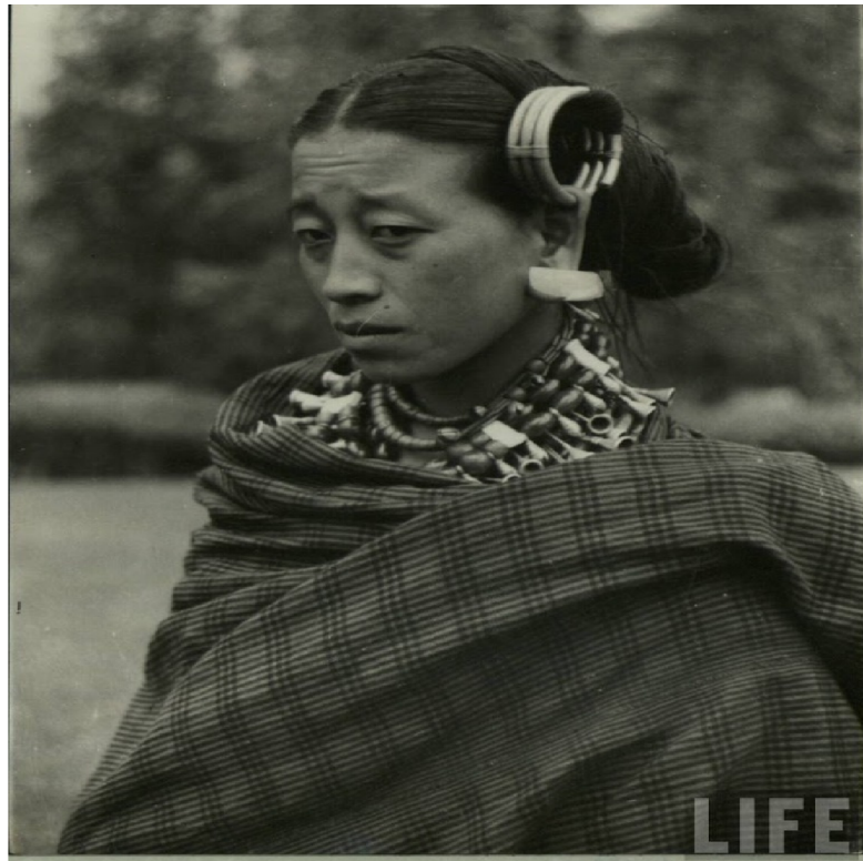
Fig. 12. Arunachali tribal women in traditional jewellery.