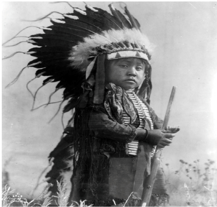
Fig. 10. Naga boy in Traditional head gear.