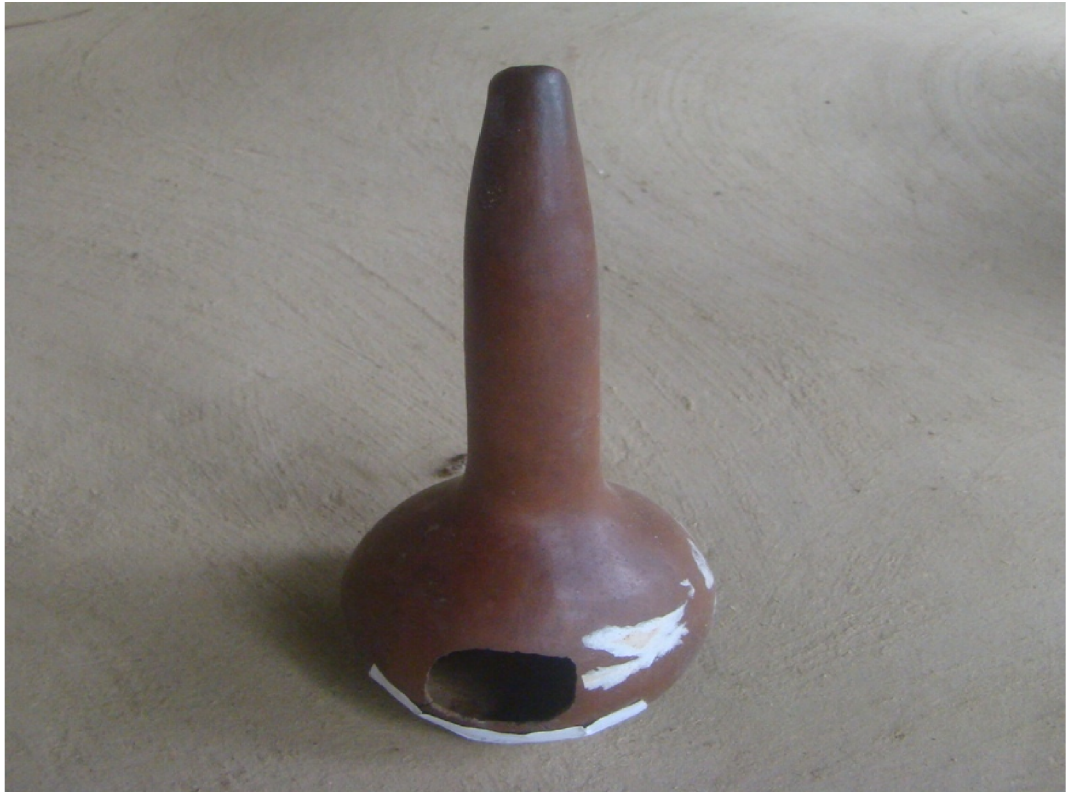
Fig. 03. Dimasa Traditional container for rice bear made of wild bottlegard