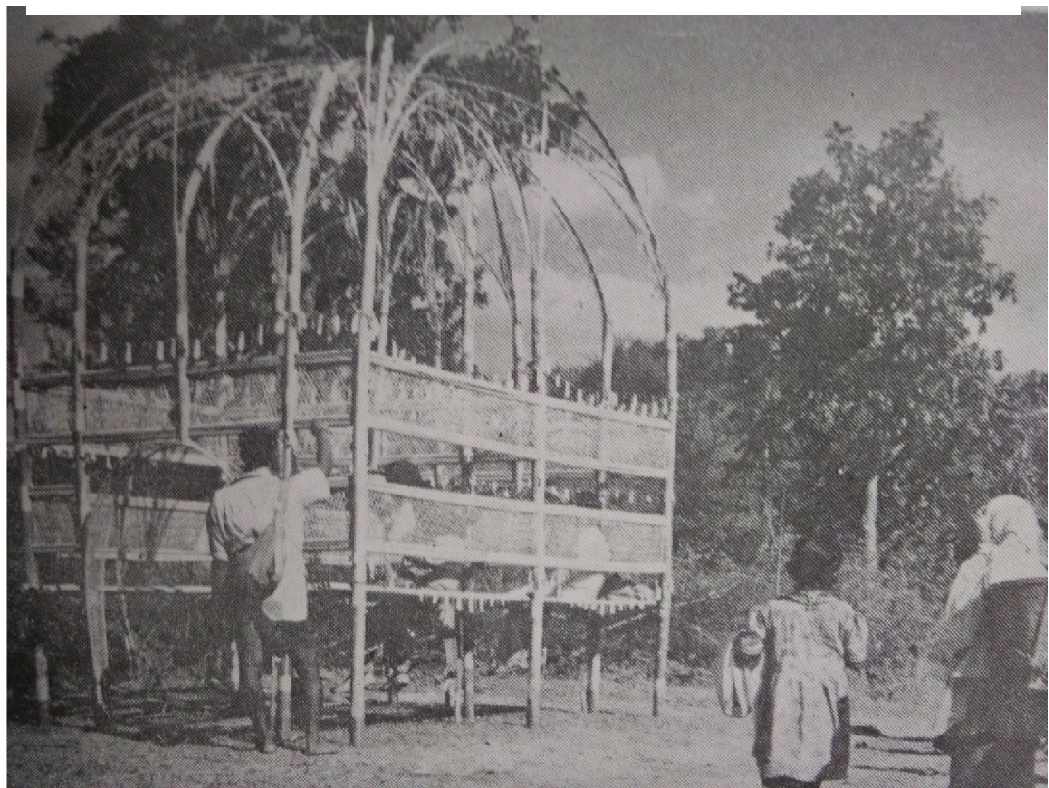
Fig. 14. Dimasa traditional welcome gate of bamboo.