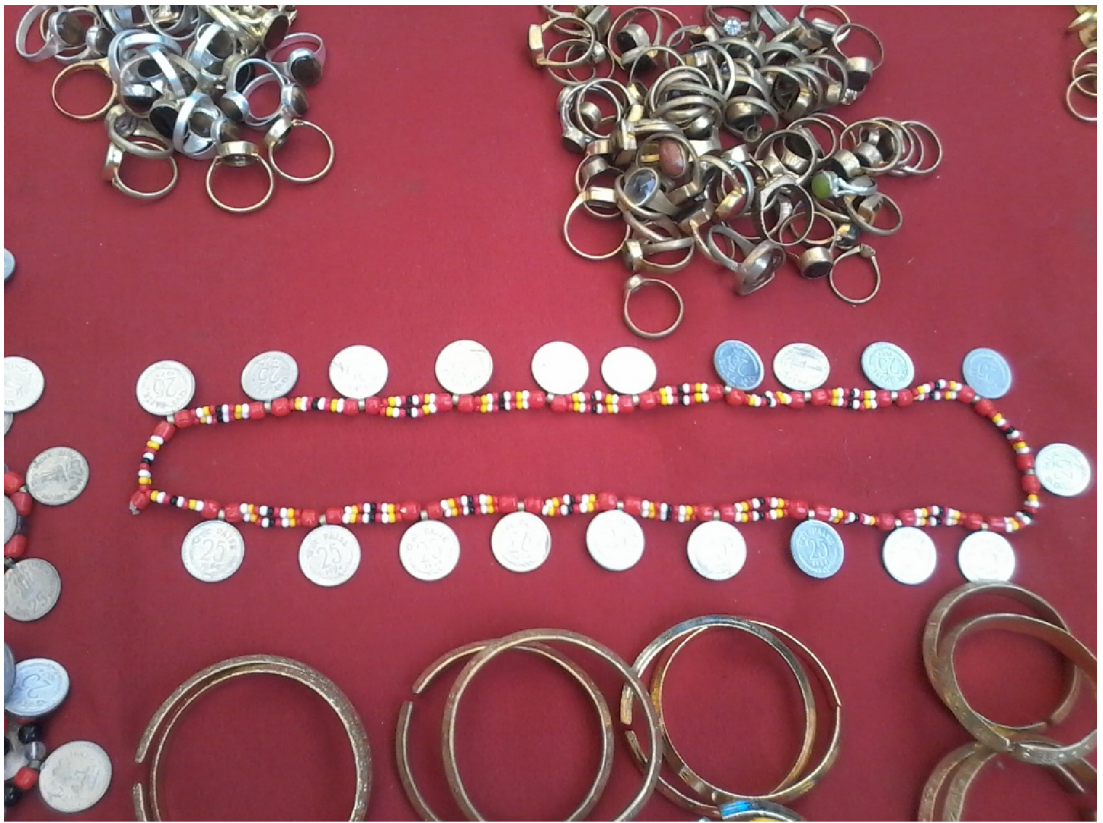
Fig. 19. Modern neckless of coins.