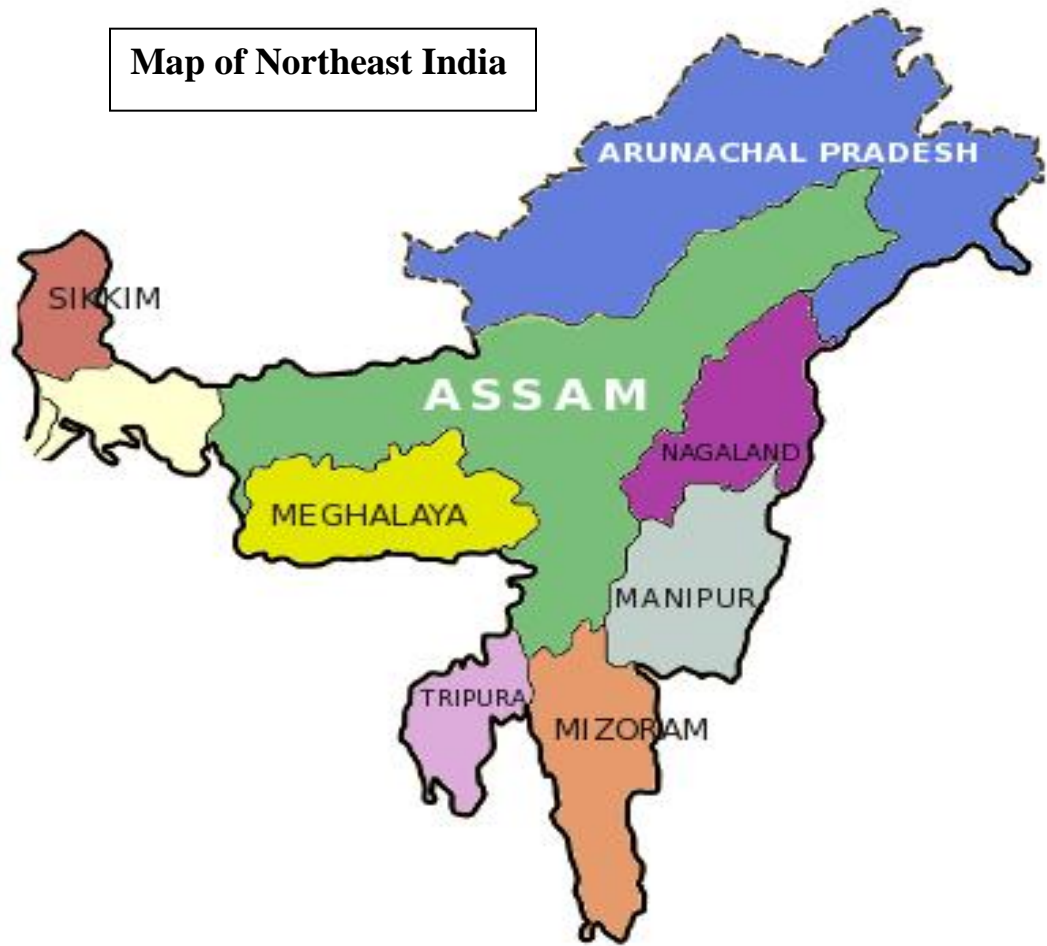
Map of Northeast India