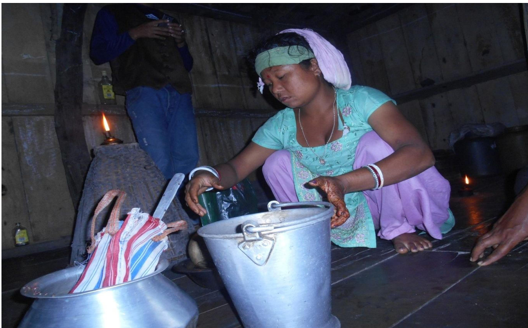
A village woman preparing local wine 'iu'