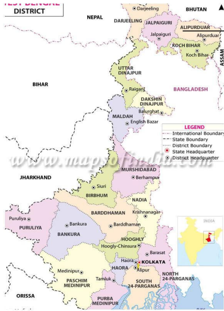
Map 2: Maps of West Bengal and Alipurduar