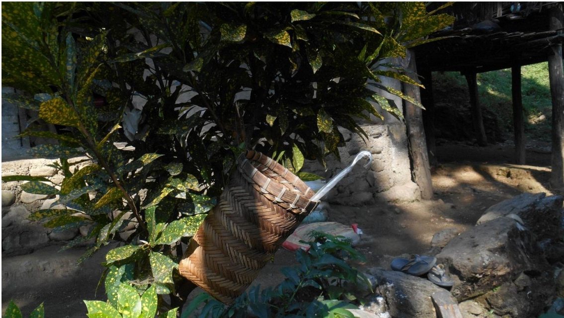
petuŋ another type of basket used in filtering the local wine called iu .