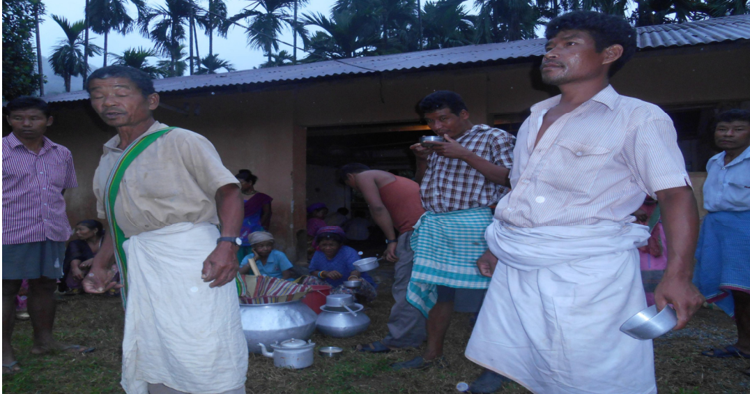
Two village priests during Demsa festival where Senza ‘supreme god’ is worshipped