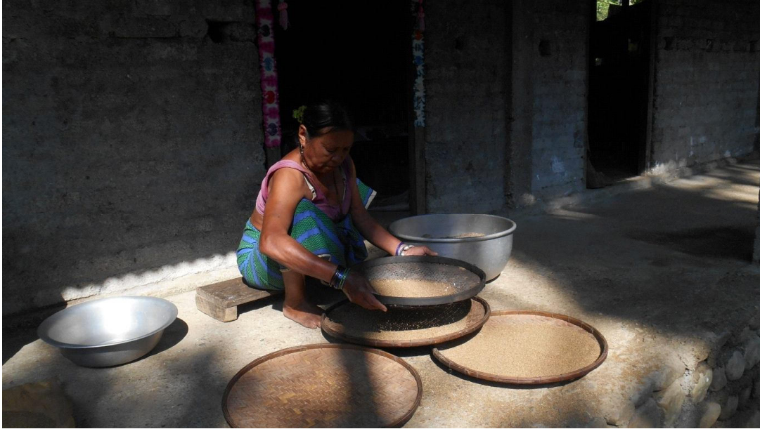
A village woman of Totopara winnowing the rice chaff in dala 'winnow'