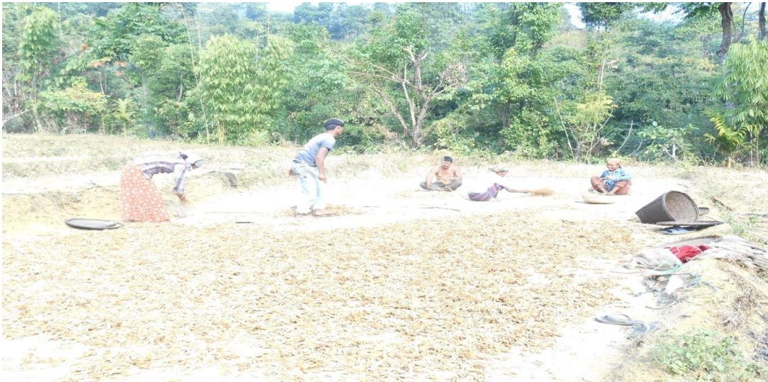
The cultivated crops called meibe used in preparing local wine iu