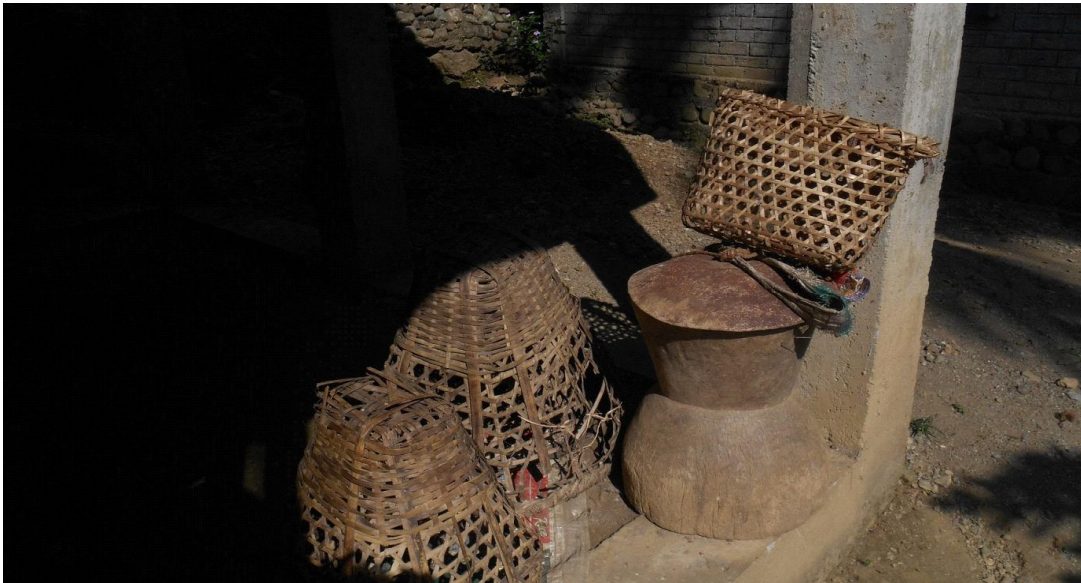
Duku : a bamboo made basket used for carrying vegetable