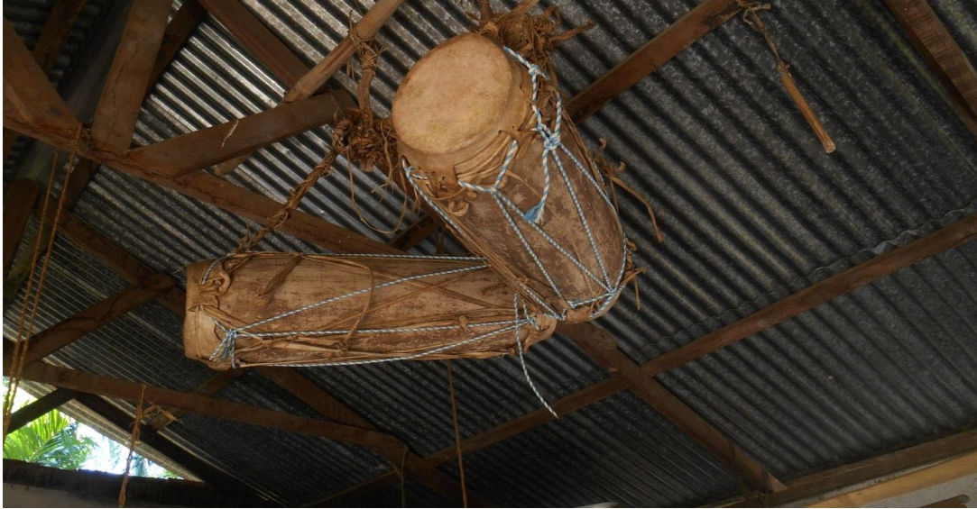
Bakuŋ(cikaimo+mogoimo) a drum made of cow skin used during festival time.