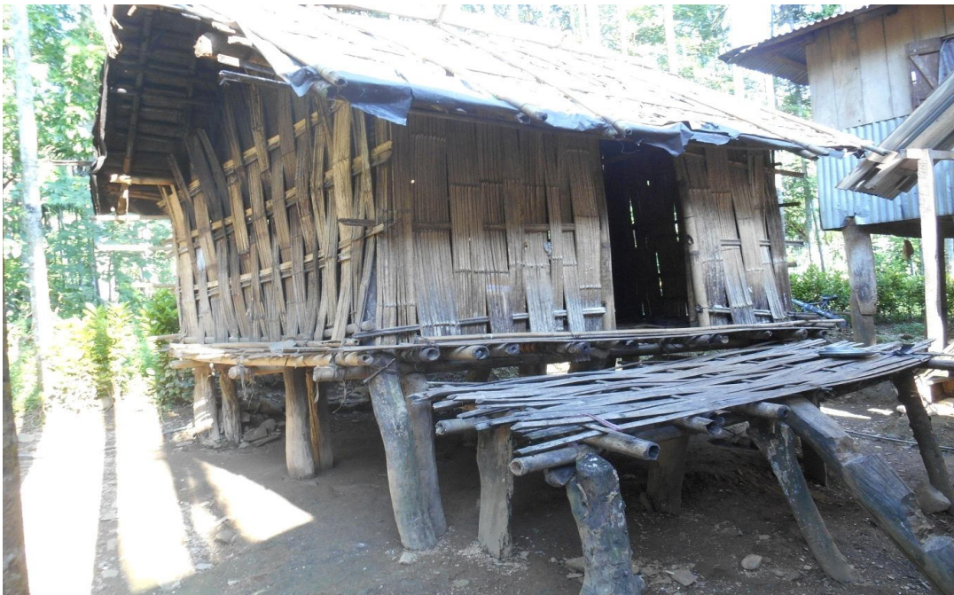
Traditional house of Toto people