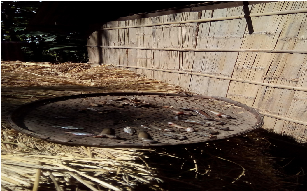
nanra a kind of 'dry fish' which are prepared after basking in the sun.