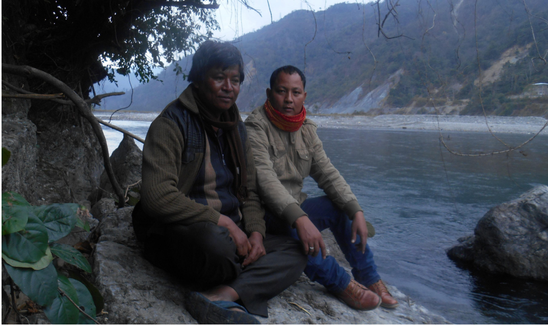
A field visit in Totopara during winter in the bank of river Torsa, which divides India and Bhutan.