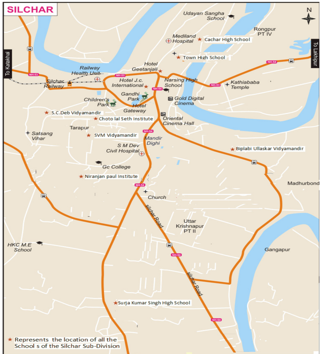
MAP 2: Locations of Secondary Schools of Silchar Subdivision, Assam

Star (*) symbol represents the locations of Secondary Schools of Silchar Subdivision, Assam