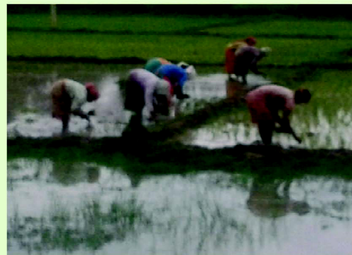
Hajong women in the paddy plantation field 'Ruwalaga'.