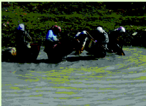
Group Hajong women busy in fishing called 'Jakhamara'.