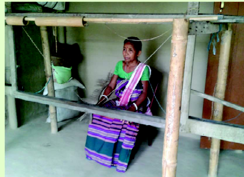
Hajong woman in traditional family loom 'Bana'.