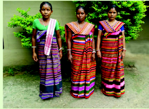
Hajong women wearing traditional Hajong dress "Rangapatin."