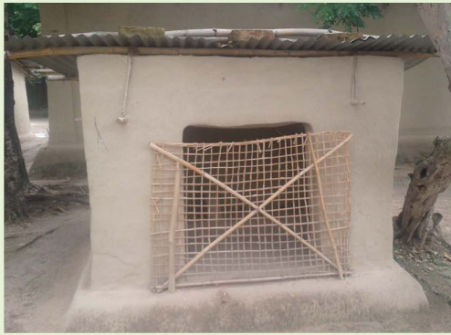
A traditional Hajong temple (Deo Ghar)