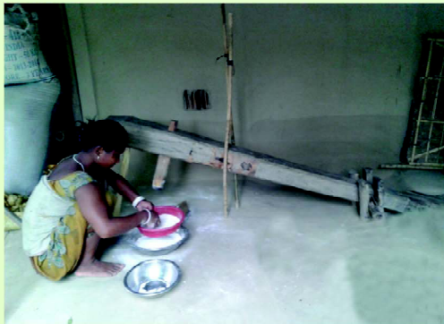
Hajong girl busy in preparing rice powder at 'Dheki'.