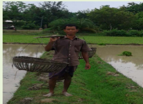
A Hajong cultivator.