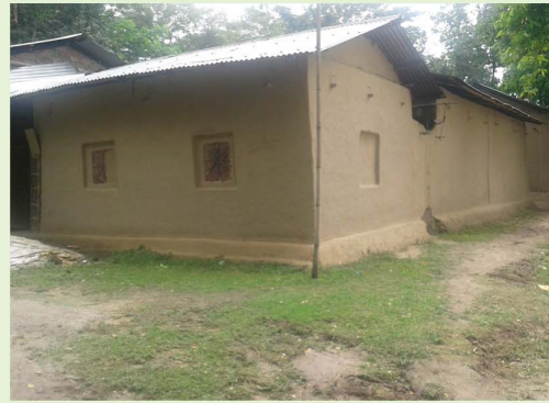
A traditional Hajong mud house (Mati Ghar)