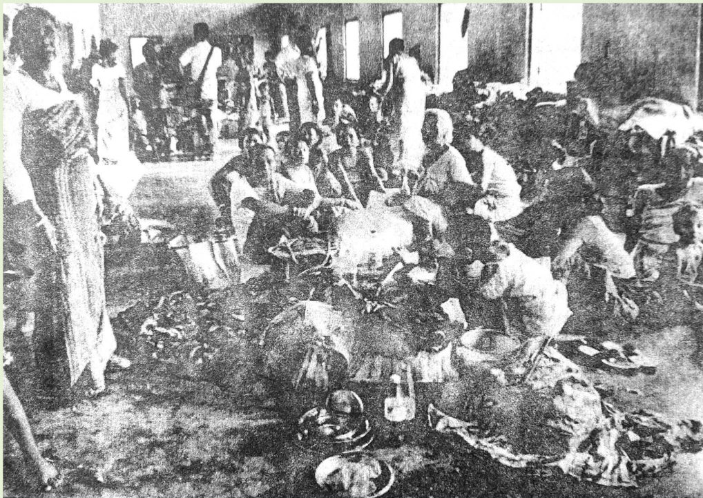
Hajong refugees in a refugee camp in Goalpara, 1964