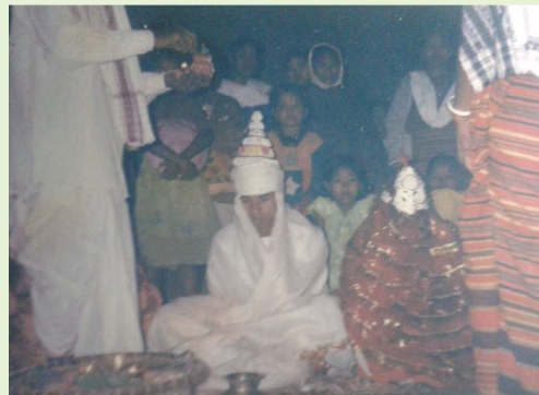
Hajong marriage in traditional attire.