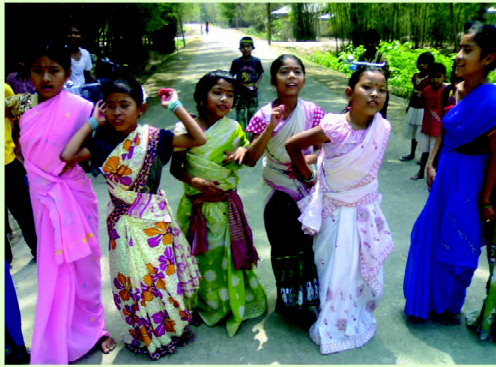
Hajong children busy in bihu dance.