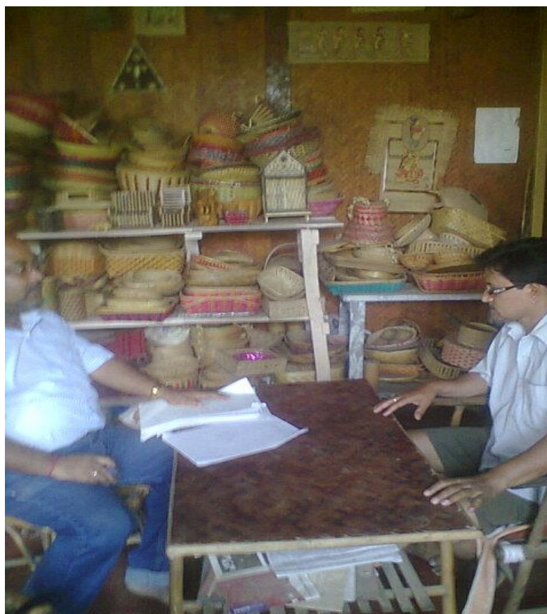
Researcher in his field study is interacting with an entrepreneur cum master trainer cum artisan at Bagabasa under Nalchar cluster.