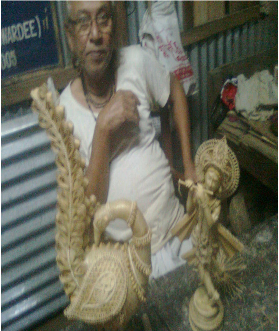
SHILPYA Guru Awardees in 2015 and National Merit awardees 1980 with his product at his factory at Town Pratapgarh under Agartala Custer.