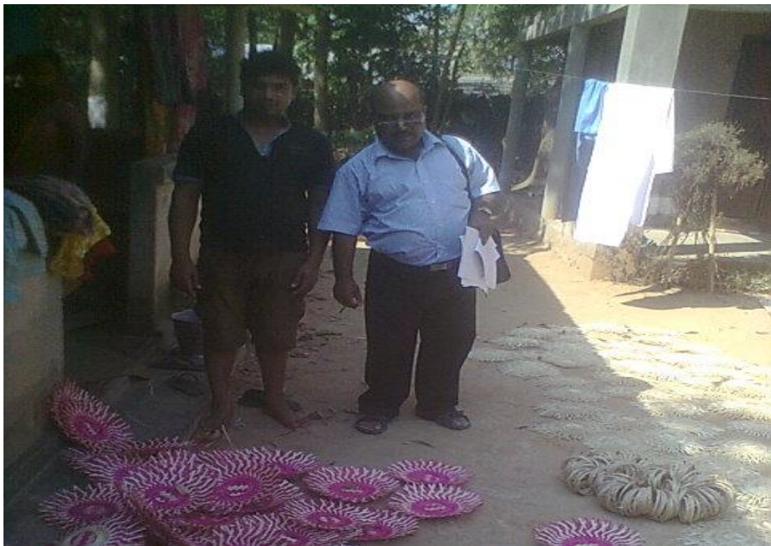
Researcher in his field study is taking interview of artisans at Madhya Charilam under Chailam cluster.