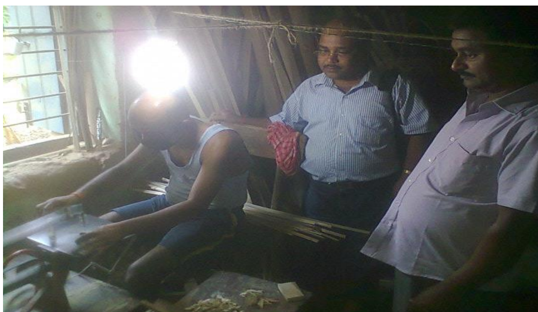
Researcher in his field study is visiting a handicraft industrial unit of an entrepreneur cum master trainer cum artisan at Aralia under Jogendranagar cluster