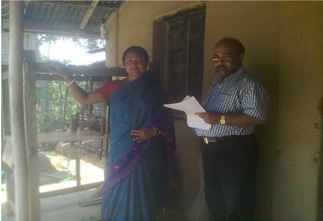
Researcher in his field study is taking interview of an artisan of Kantashewla under Jogendranagar cluster.