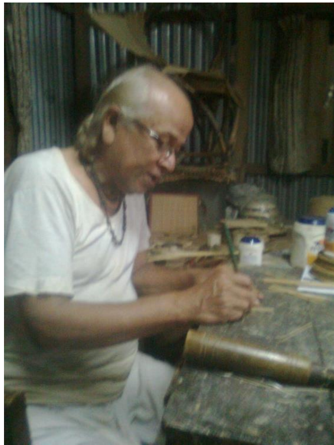
SHILPYA GURU Awardees in 2015 and National awardees in engaged himself in craft work at his home