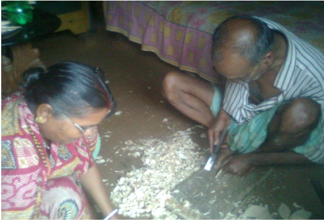
Artisans in Town Pratapgarh under Agartala cluster are working at home.