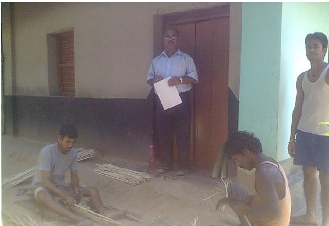
Researcher in his field study is taking interview of artisans at Dakshin Charilam under Chailam cluster