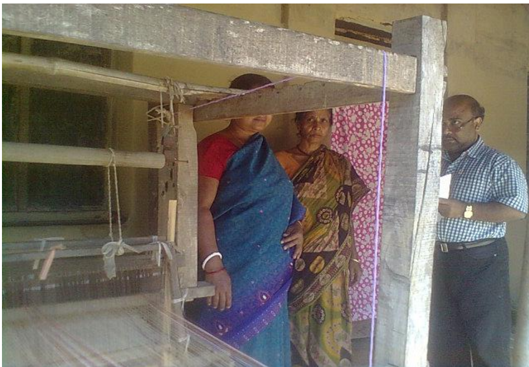
Researcher is visiting the Artisans in Kantashewla under Jogendranagar Cluster in his field study