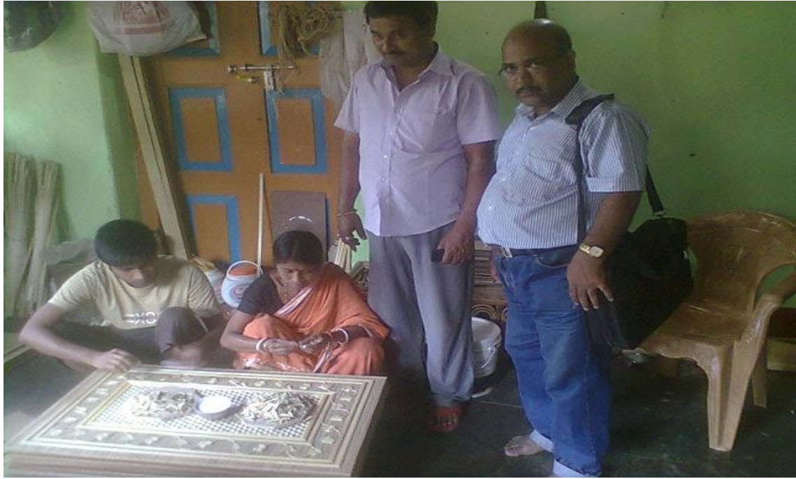
Artisans are engaged in producing Partition in a factory of an entrepreneur in Aralia under Jogendranagar cluster.