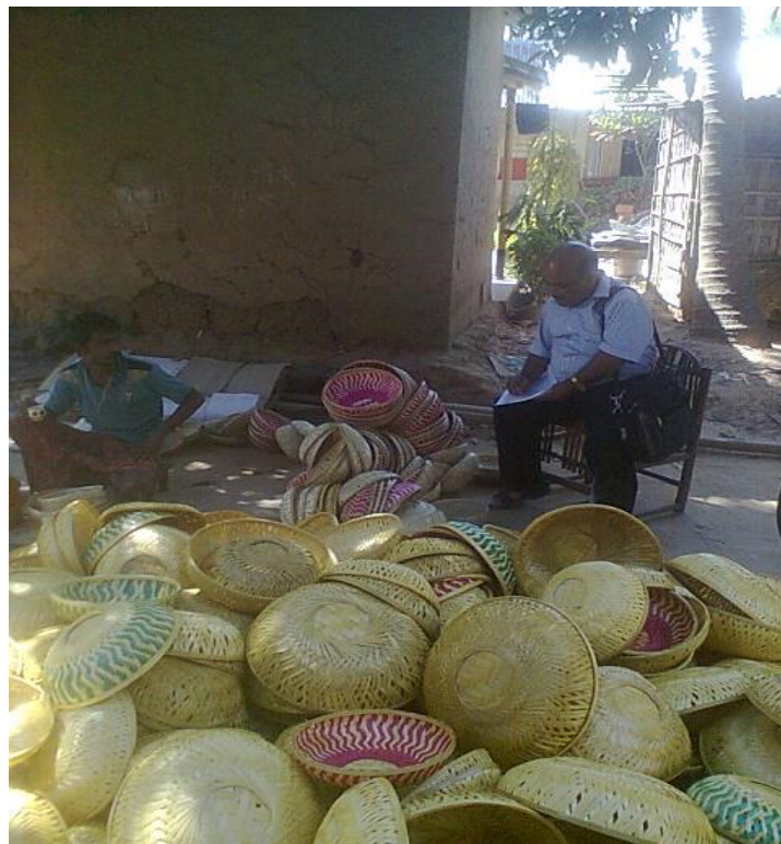
An Artisan of Dakshin Charilam under Charilam Cluster with his product.