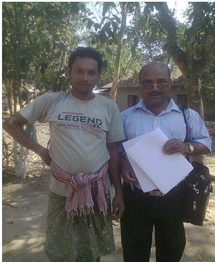
An Artisan in Charilam Cluster who attended fair in Malaysia.