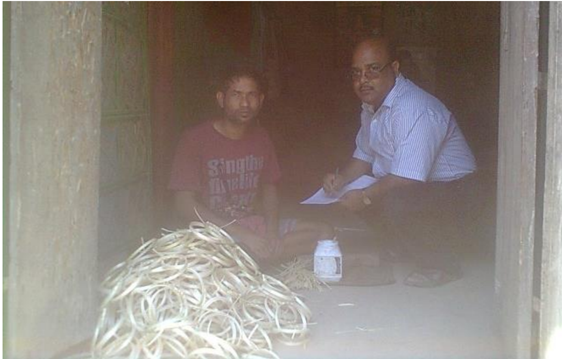
Researcher in his field study is taking interview of an entrepreneur cum artisan at Dakshin Charilam under Chailam cluster who is producing 'Ring' (CHAK) which is used as a raw materials of basket..