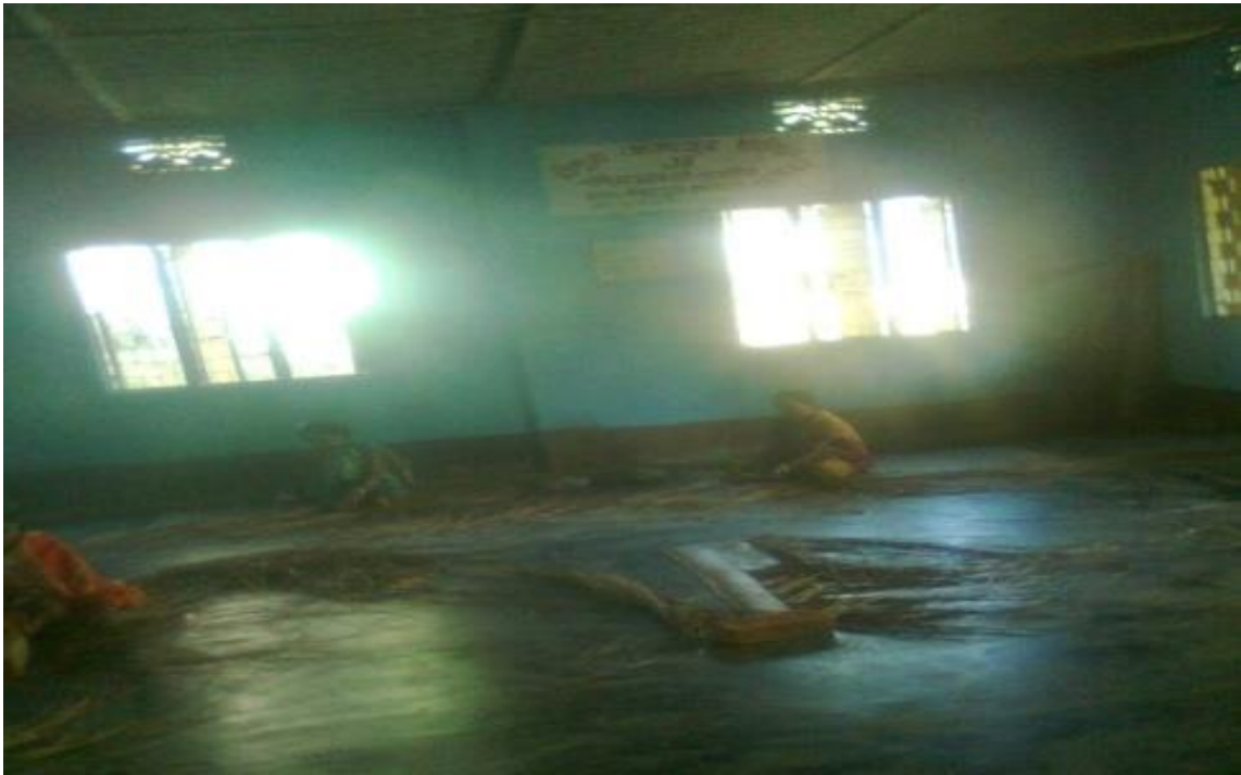
Artisans are engaged in producing bet for pati in Baikhora cluster