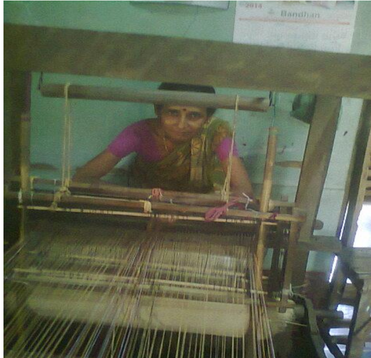
An Artisan cum entrepreneur of Mahashakti under Jogendranagar Cluster is working with her Tant machine.