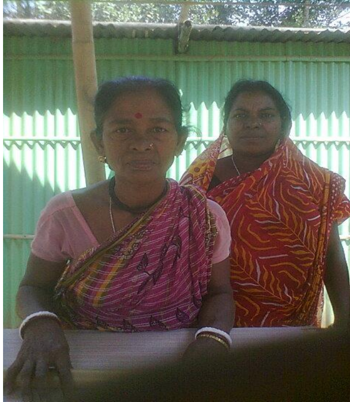
Artisan is working with her Tant machine at Duttapara in Jogendranagar Cluster.