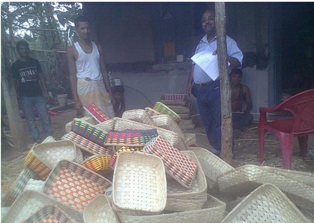
Researcher in his field study with an entrepreneur cum master trainer cum artisan at west Nalchar under Nalchar cluster.