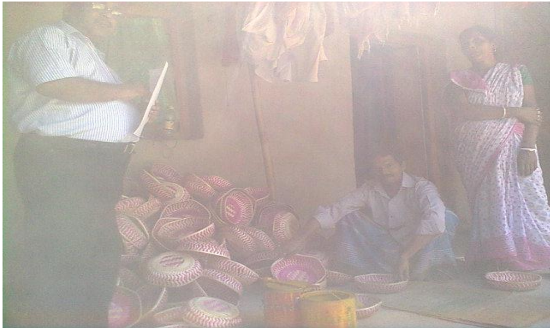
An Artisan cum successful entrepreneur in Charilam Cluster