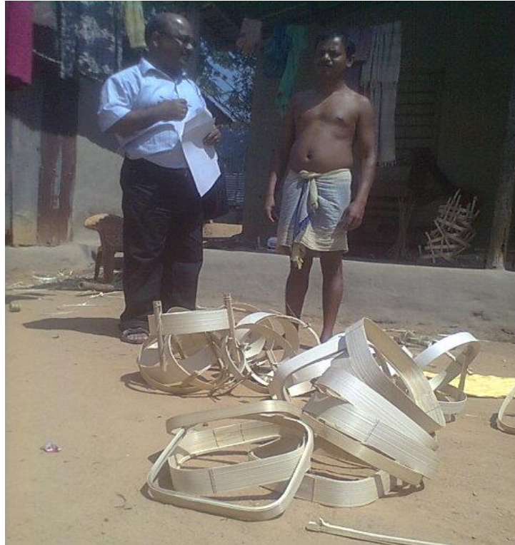
Researcher in his field study is taking interview of artisan cum entrepreneur in his factory at Dakshin Charilam under Charilam Cluster.