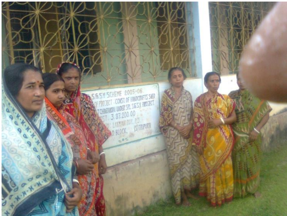
Artisans in the premises of Baikhora cluster