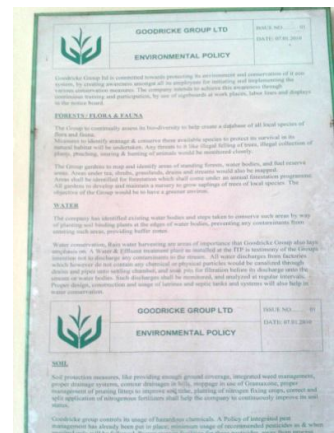
GGL-Koomber Tea Garden