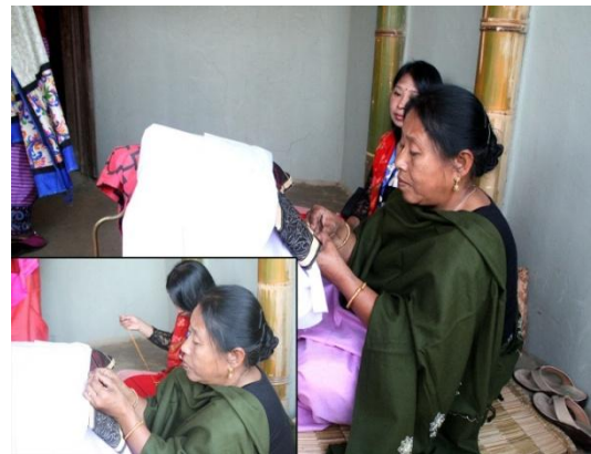
Embroidering phanek border