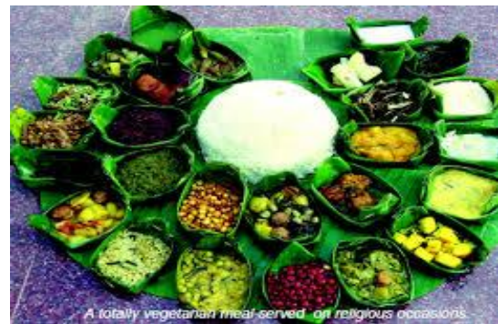
Manipuri Vegetarian cuisine