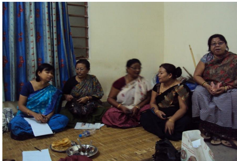
With Secretaries of Nupi-Ima Keithel ( Laxmi Keithel , Purana Keithel & New Keithel )