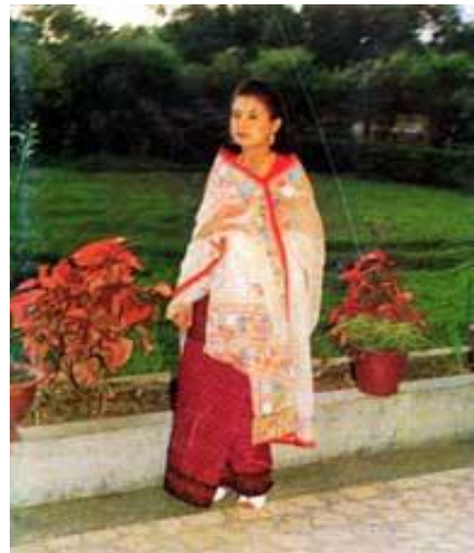
Phigeh phanek and muga innaphi