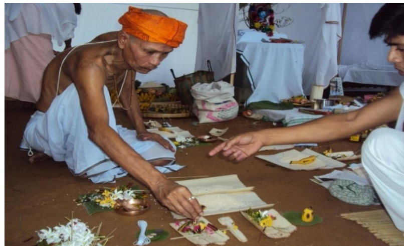
Kirathangba performing Shradha rites