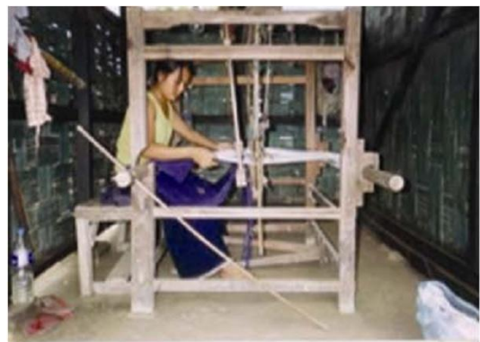
Throw shuttle loom