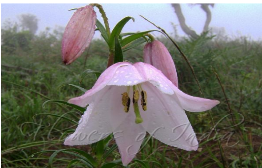
Shiroi Lily – State Flower