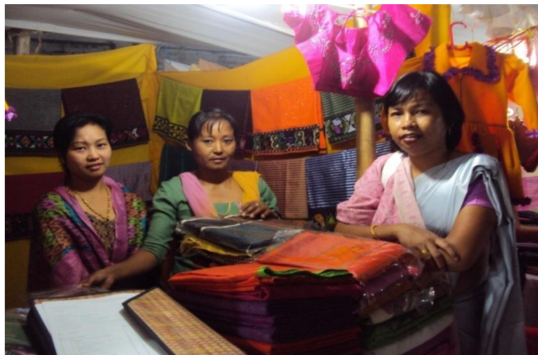
In a trade fair