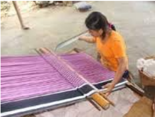
Weaving phanek on loin loom