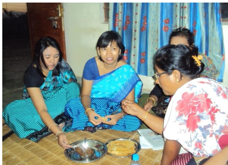
Having snacks with them