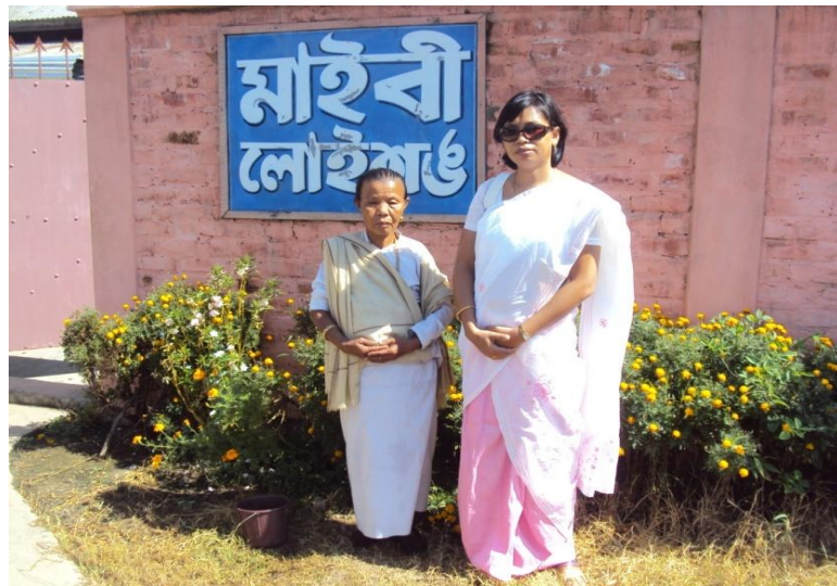
With a Maibi