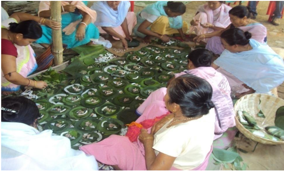
Khundau shuba women making kwatangla