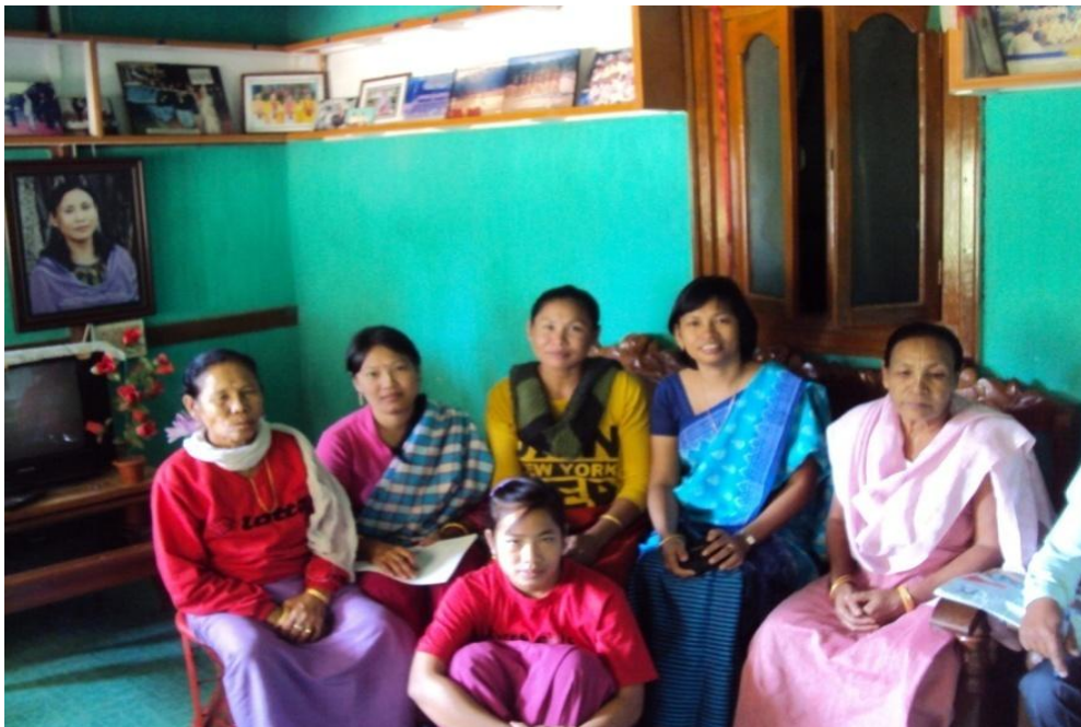
With several respondents