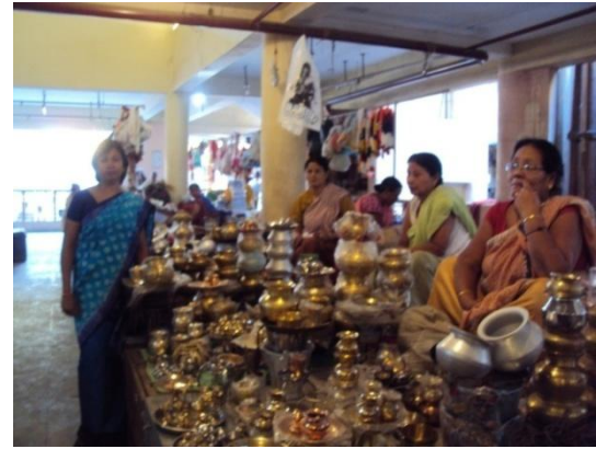
In Nupi-Ima Keithel (utensil section)