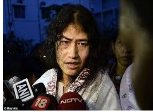
Irom Sharmila Chanu