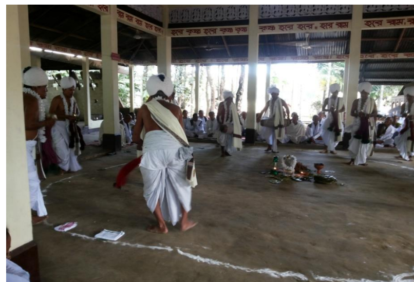
Nat Pala Sankirtan