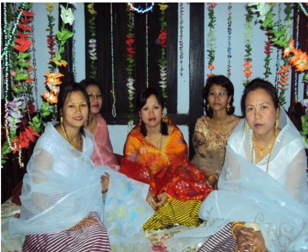
Mayeknaiba phanek and white innaphi