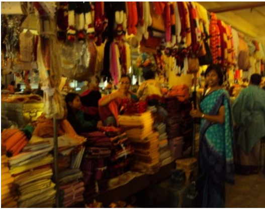
In Nupi-Ima Keithel (cloth section)