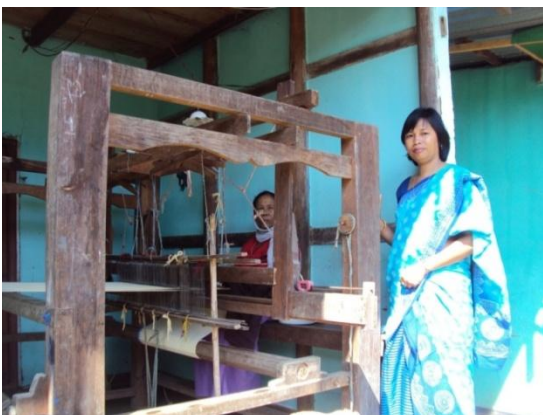
Fly shuttle loom