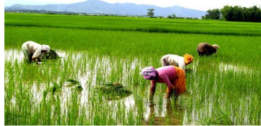
Women working in paddy fields