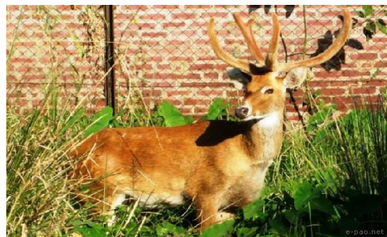
Sangai – State Animal