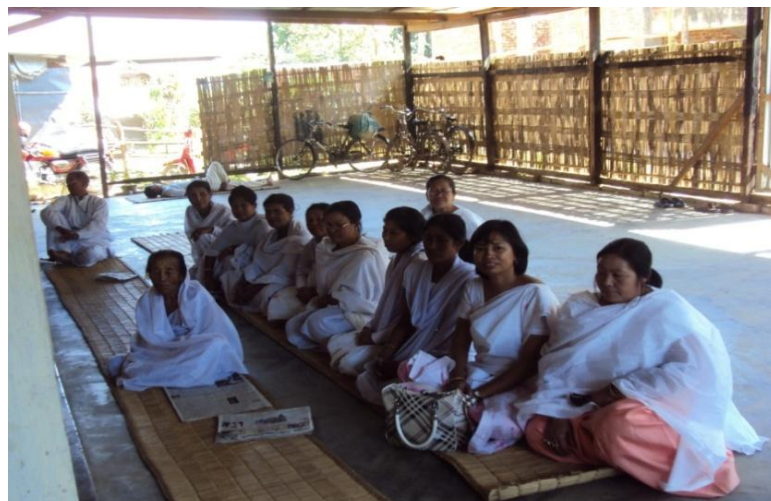
With maibis in a Maibi Loishang