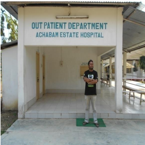
In Front of Achabam Tea Estate Hospital