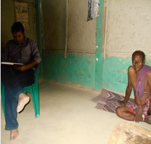
Researcher Collecting Data from an Adivasi in Doloo