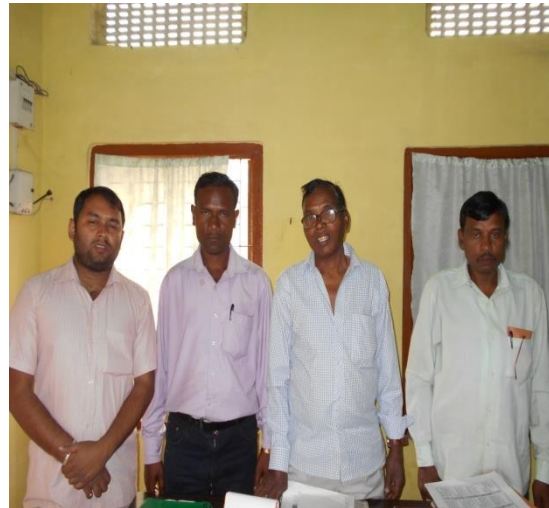
Researcher with Office Staff of Assam Cha Sramik Mazdhur Shangha