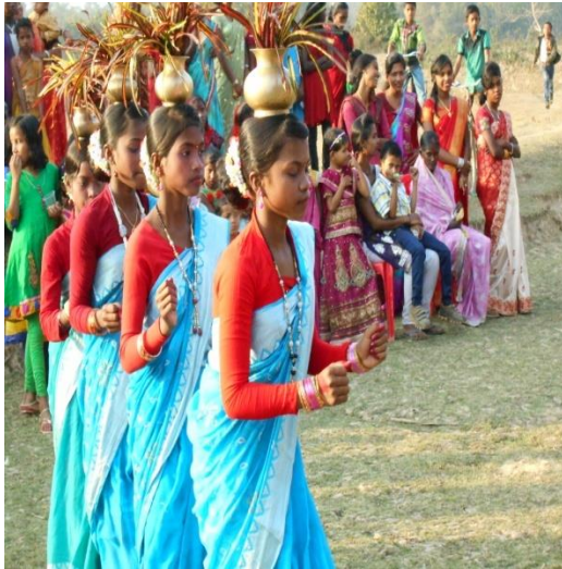
Santhal Girls Performing Jhumur Dance in Doloo