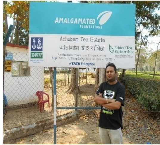
In Front of Achabam Tea Garden Factory