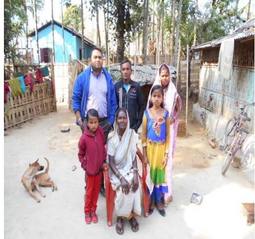
Researcher with a Santhal Family in Doloo