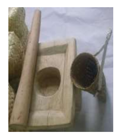
Fig. 6: Sum (mortar and pistle)