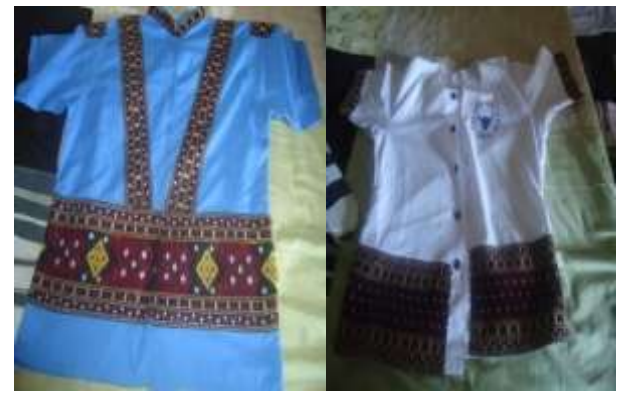
Fig.1 (a). Male attire designed with Saipikhup and Thangnang .