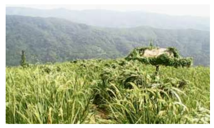
Fig 2: Jhum rest house amidst ripe rice-field.