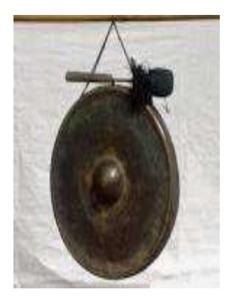
Fig. 2: Dahpi (Gong)