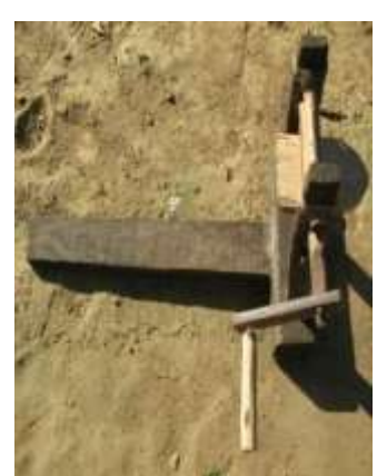
Fig. 7: Patheh (indigenous tool for separating cotton from the seed).