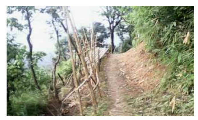
Fig. 1: Way to jhum field showing a resting place called Kem.