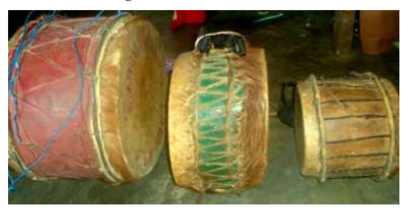
Fig. 1: Khong (Set of Drums)

Plate 4: Some Indigenous Thadou-Kuki Musical Instrument.