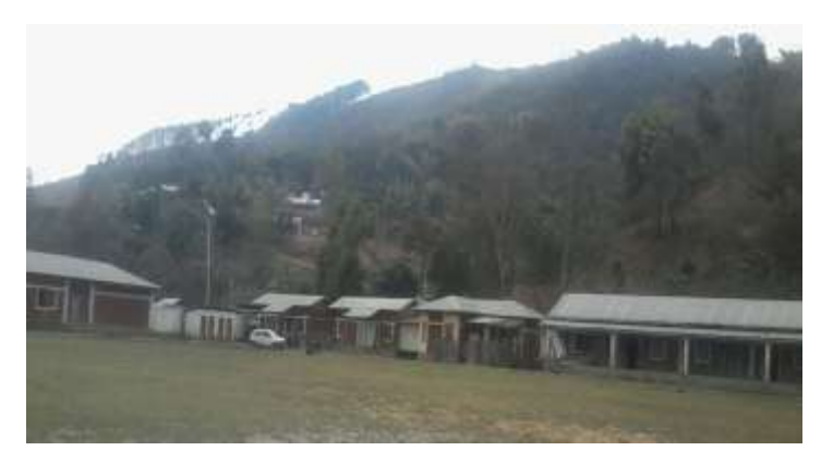
Fig. 1: A view of Thangtong Higher Secondary school classrooms (the only Government run higher secondary school in Sadar Hills sub-division of Senapati district).