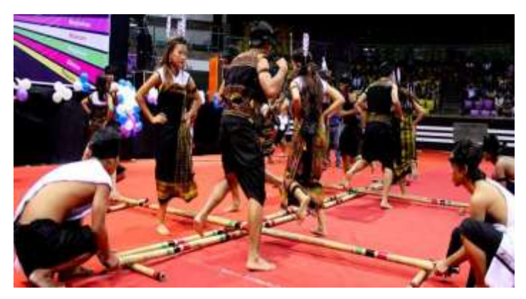
Fig. 1: Suhta Lam (Bamboo dance) performed on Chavang Kut Festival at 1<sup>st</sup> M.R. Imphal, 2014.