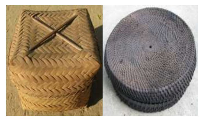
Fig. 2: Pocha (bamboo-made container) and Sinkhup (cane container)