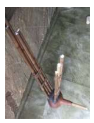
Fig. 4: Goshem (Bagpipe)