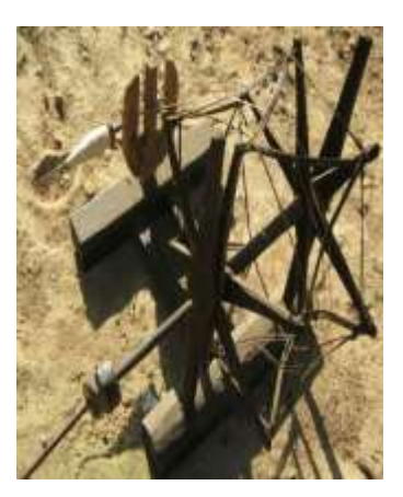
Fig. 8: Mui (spinning wheel)