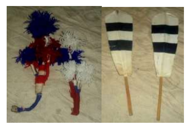
Fig. 1 (c). Tupah (head dress) for both men and women.