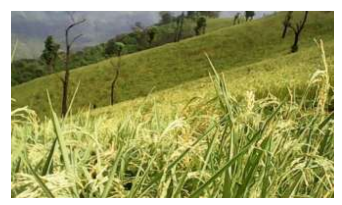
Fig. 4: Full developed rice ready to be harvested.