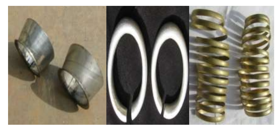
Fig. 2 (a). Bilkam (earring wore in the earlobe ).