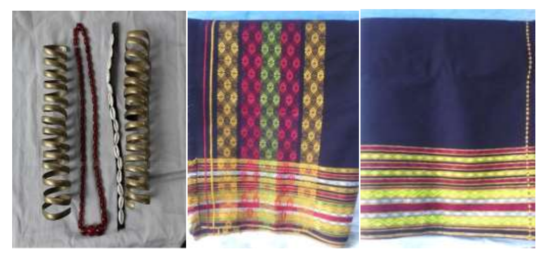
Fig. 2 (e) Chao and Khichong (bangle and necklace)