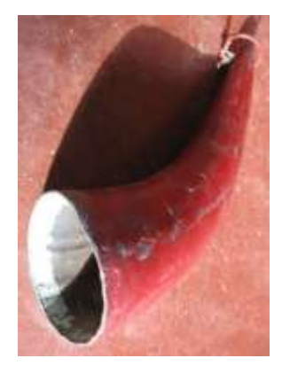
Fig. 5: Selki (Mithun Horn)