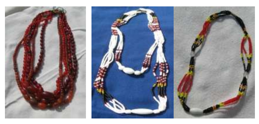
Fig. 2 (c) Khichong (red rare necklaces).