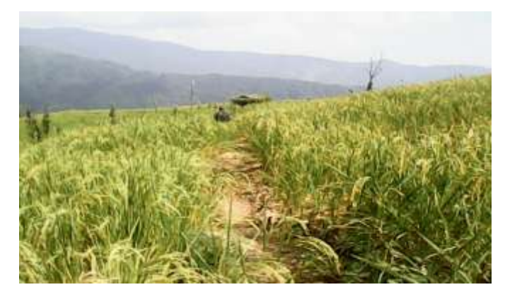
Fig. 3: View of a narrow path in Jhum field.