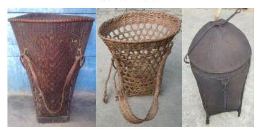
Fig. 1: Bengbit, Khongvang along with Nam and Lel (Baskets made from cane and bamboo for carrying and storing of things).