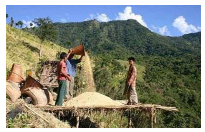
Fig. 5: A view of harvesting rice in jhum field.