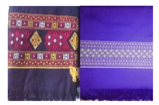
Fig. 1 (b) Saipikhup and Thangnang (traditional shawl mostly wear by males)