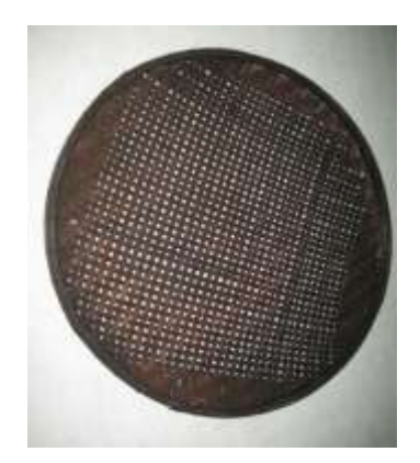
Fig. 4: Godal (used for drying chilly etc.)