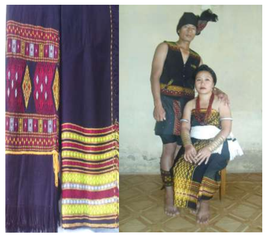
Fig. 3 (a): Saipikhup (male shawl)