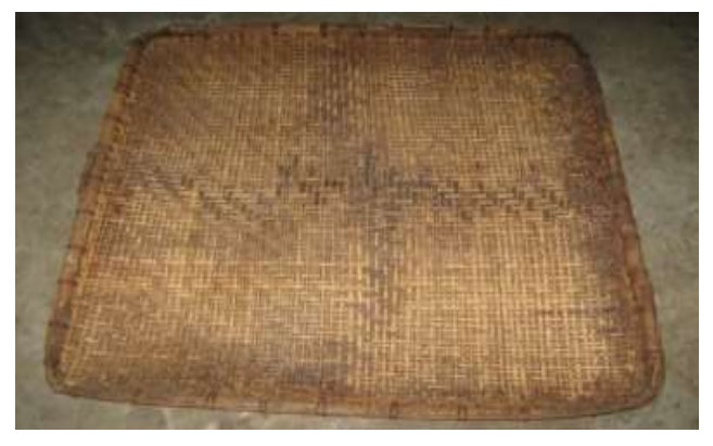
Fig. 5: Changhah (used for drying paddy for grinding)